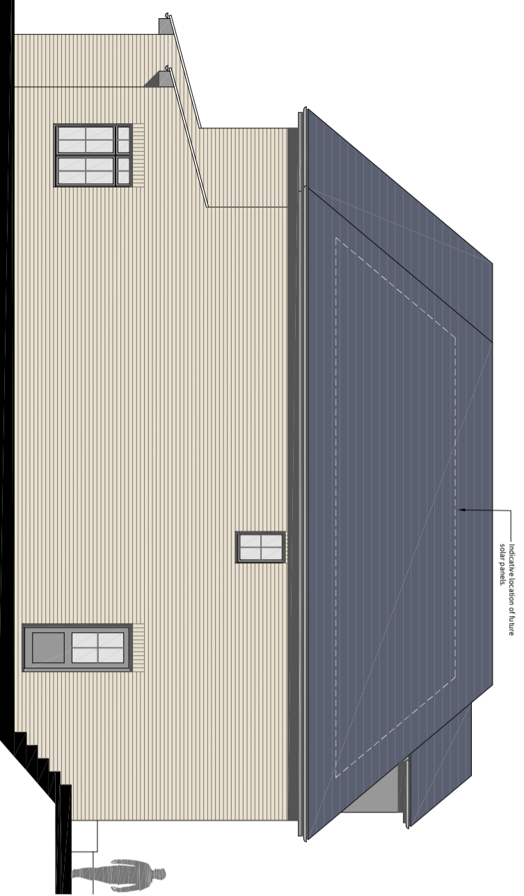
PROPOSED FRONT ELEVATION (EAST)