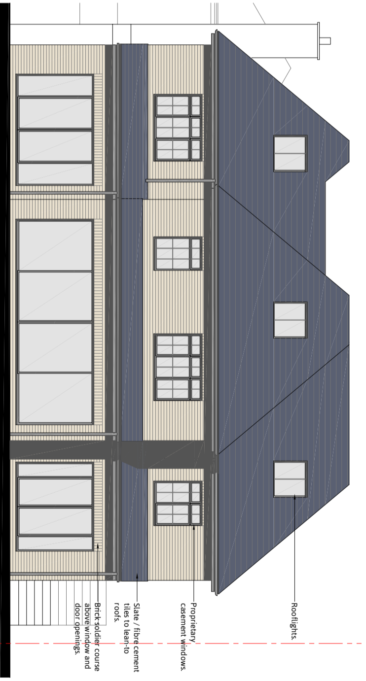
PROPOSED SIDE ELEVATION (NORTH)