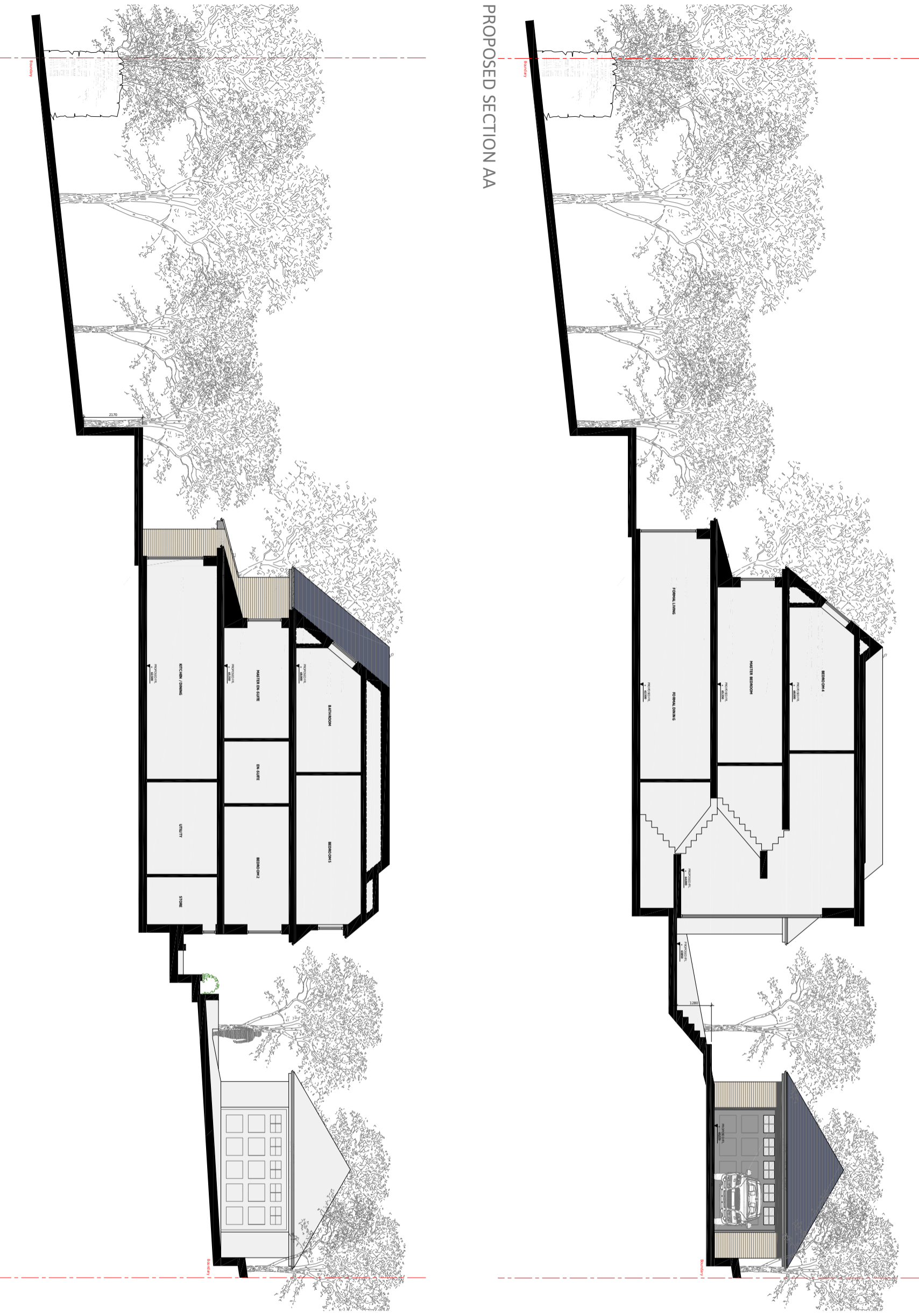
PROPOSED SECTION AA