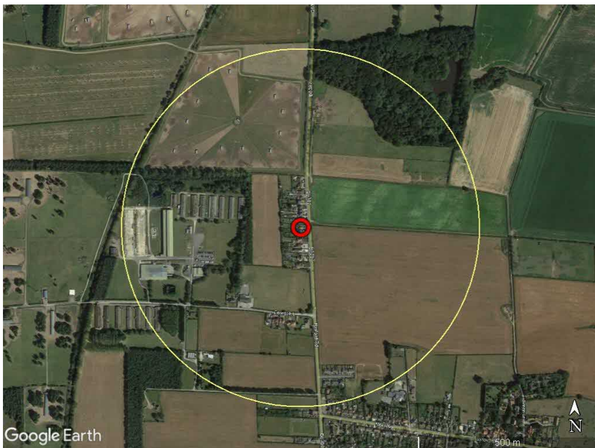
Figure 1 – Site Location

The habitats in the area are suitable for foraging and commuting bats.