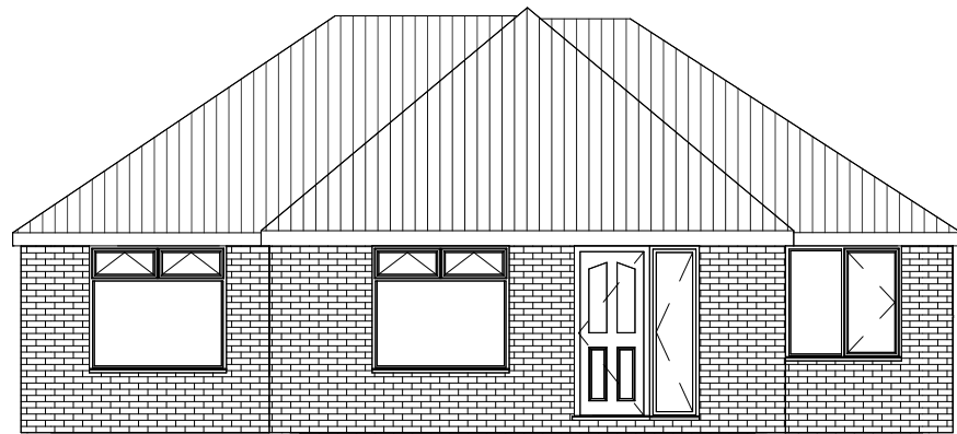
3 Proposed Front Elevation 1 : 100