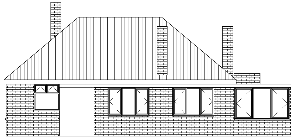
2 Existing Side A Elevation 1 : 100