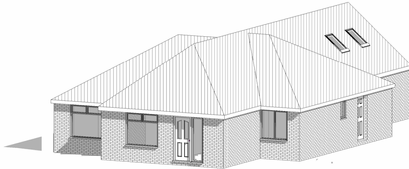
1 3D View 1