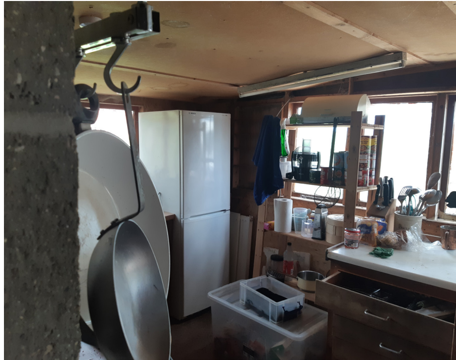
Photographs of interior of lodge whilst Matthew's cousin, Robbie Claridge was living in the lodge.