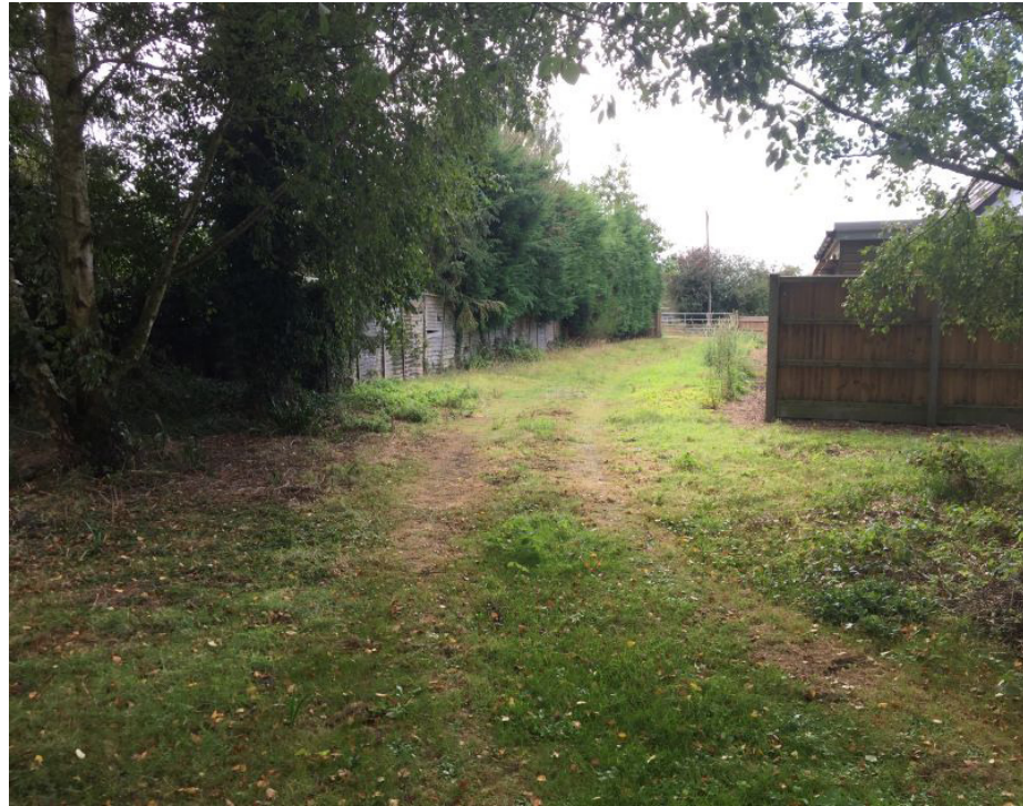
Photographs of site as displayed on the Agent's listing prior to purchase by Matthew Ambrose.