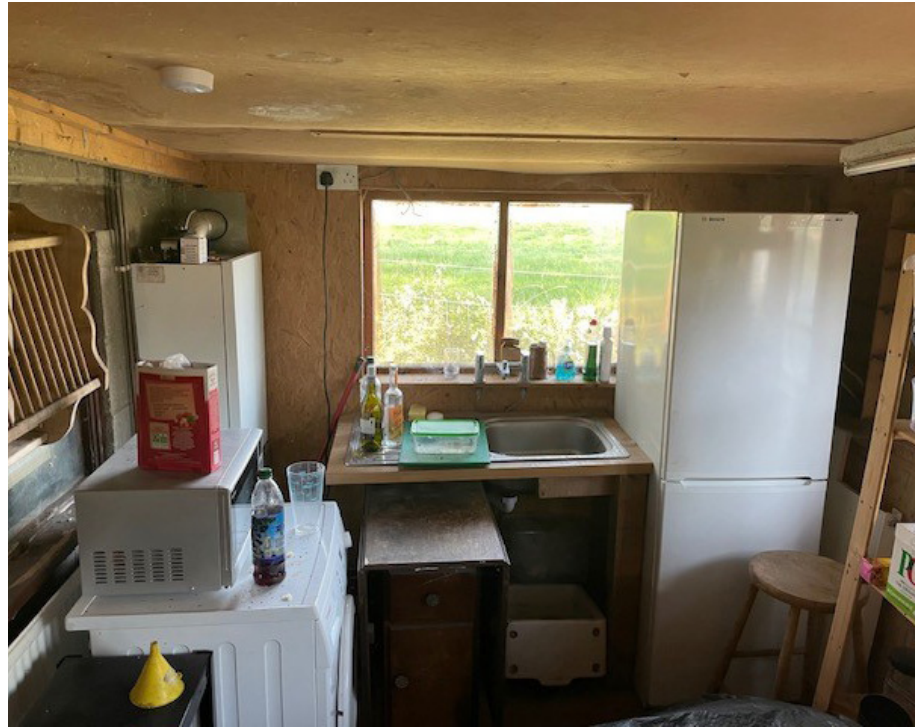
Photographs of interior of lodge when Matthew's cousin, Robbie Claridge began living in the lodge.