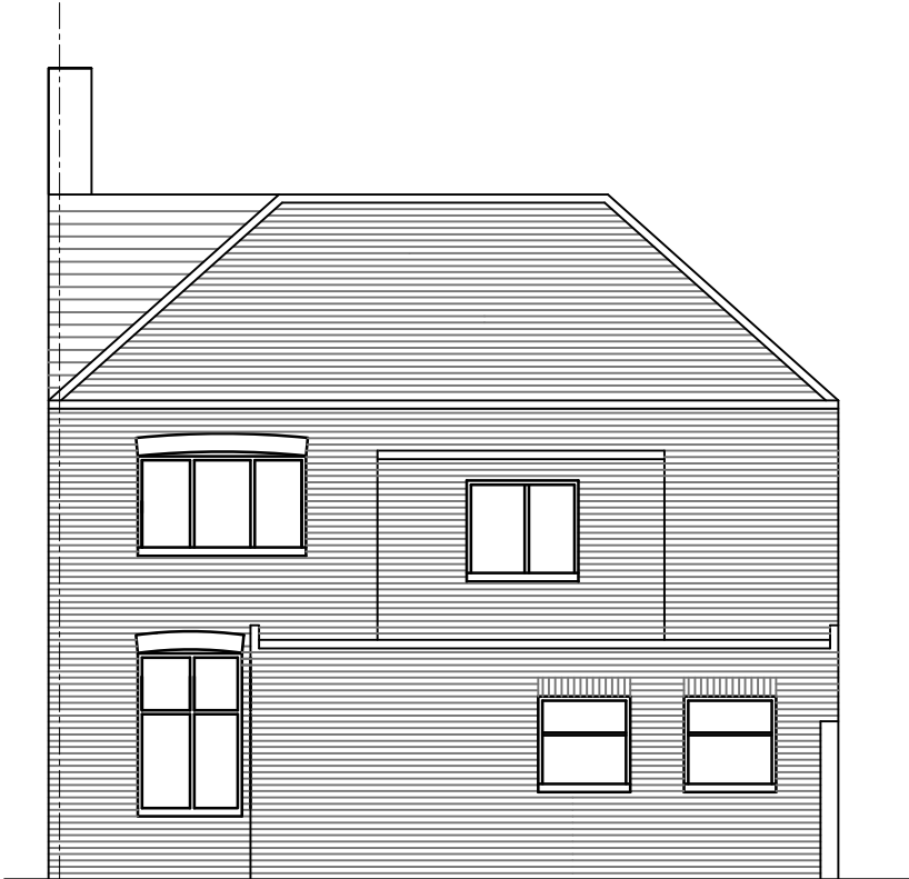
Existing Rear Elevation 1:100