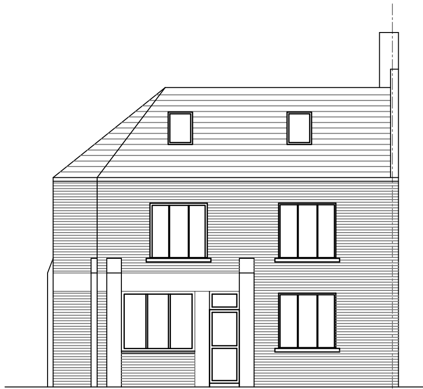
Existing Front Elevation 1:100