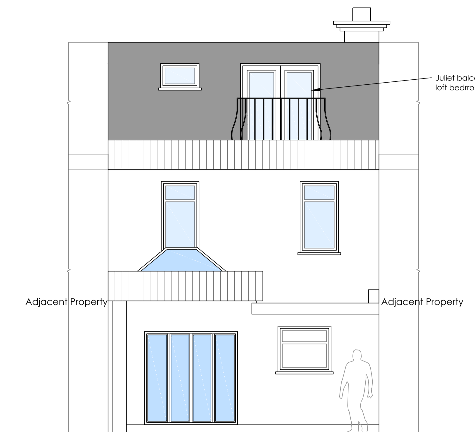
Proposed Rear Elevation Scale 1:50@A1