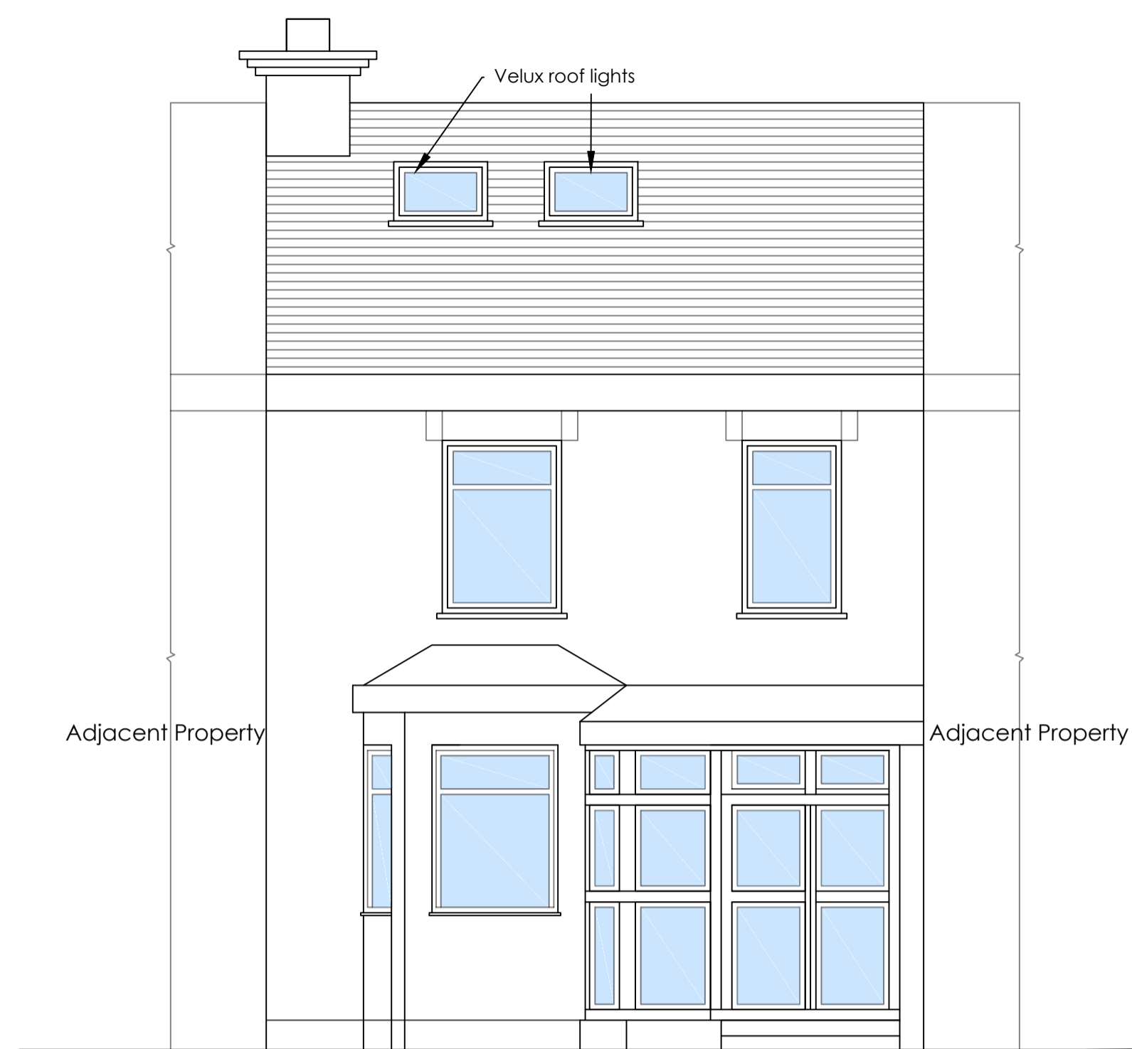
Proposed Front Elevation Scale 1:50@A1