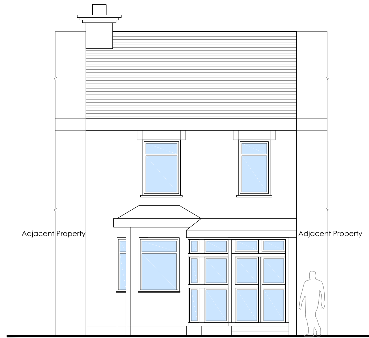
Existing Front Elevation Scale 1:50@A1