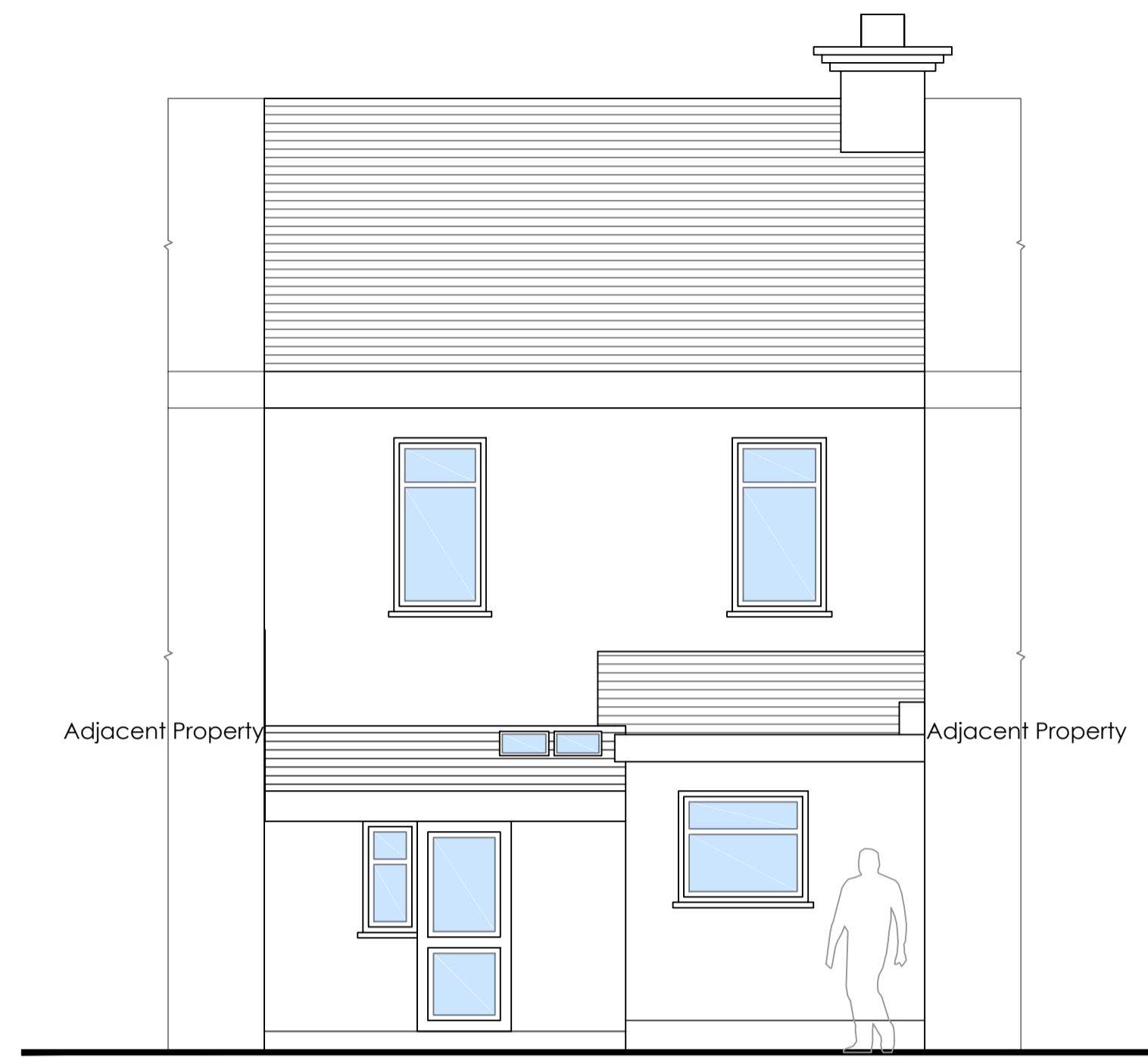
Existing Rear Elevation Scale 1:50@A1