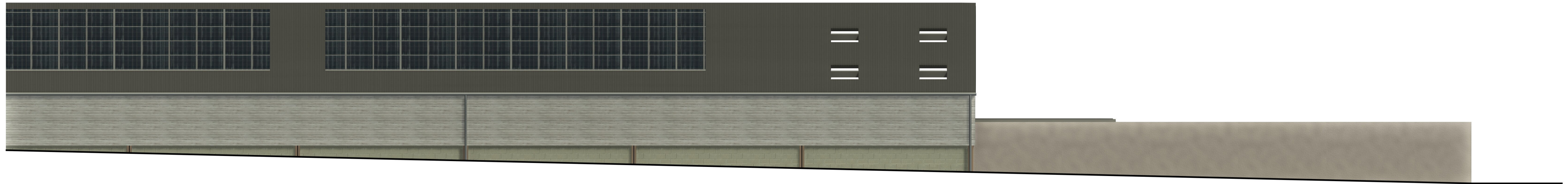
Rear Elevation - As Existing 1 : 100