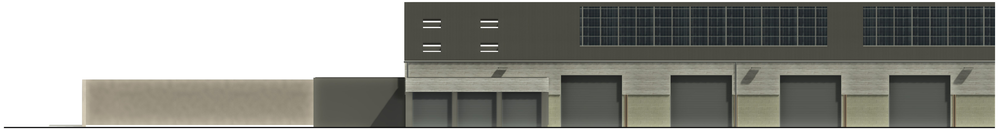
West Elevation - As Existing 1 : 100