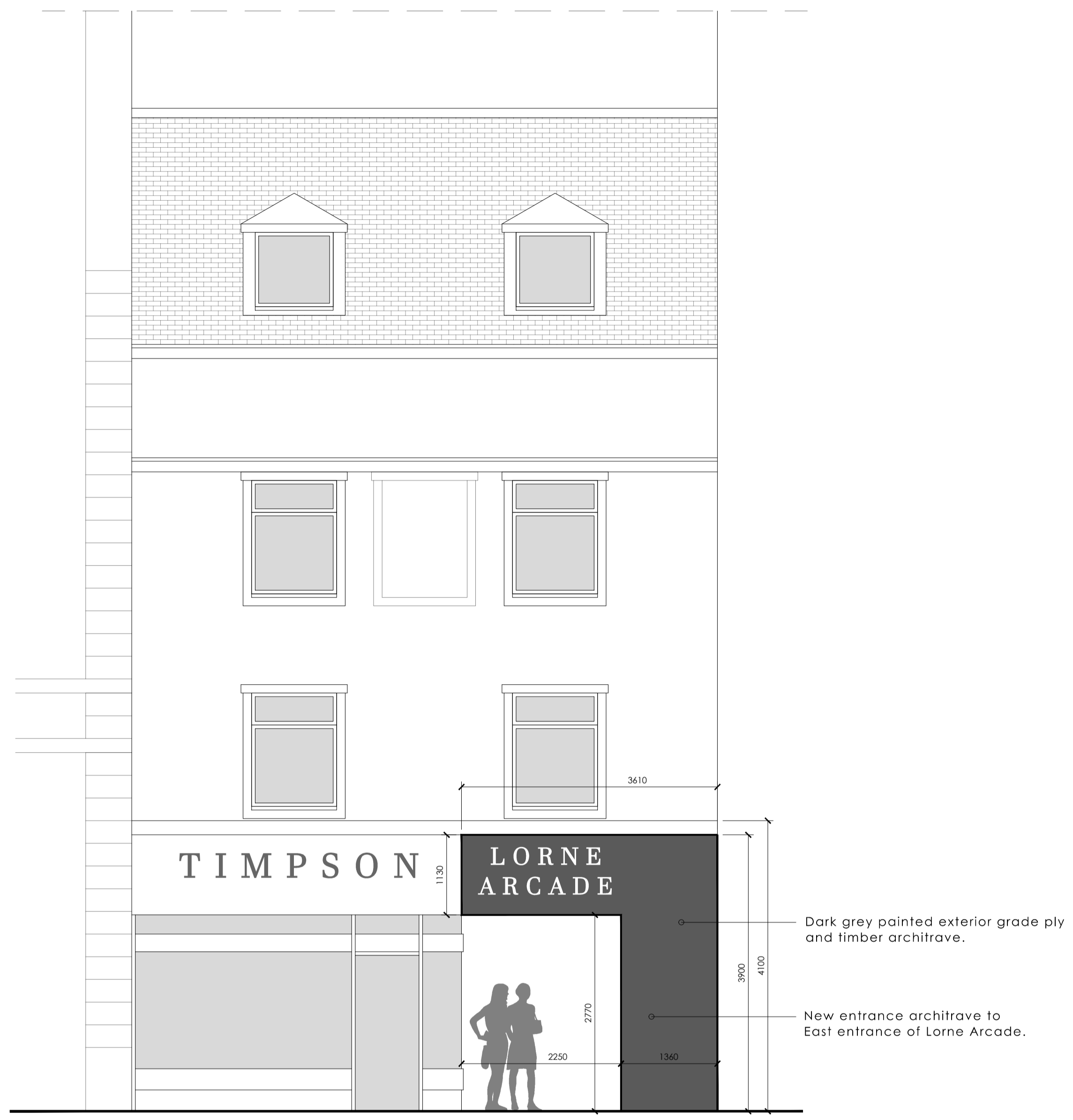
PROPOSED - EAST (HIGH STREET) ELEVATION 1:50