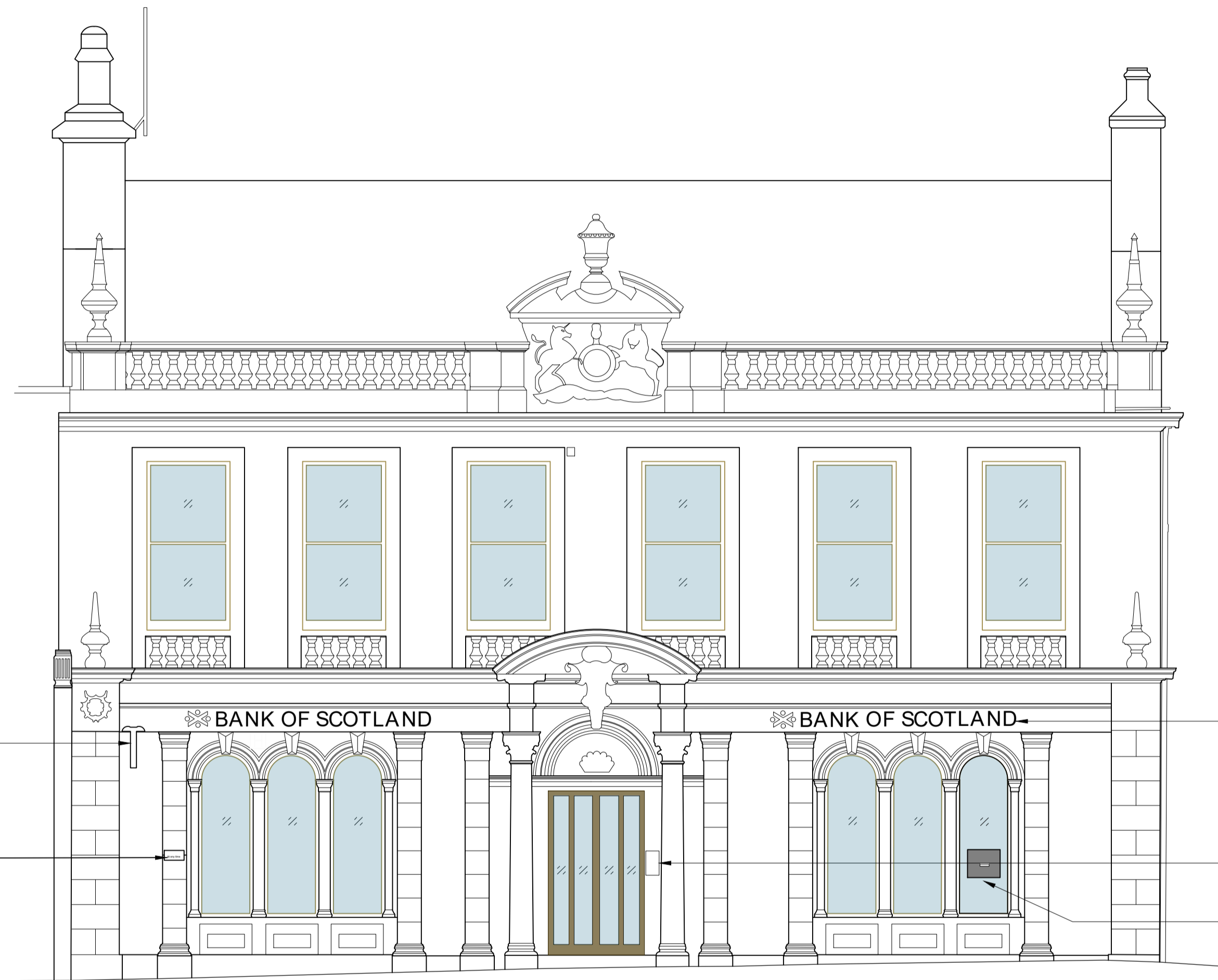
Front Elevation - Dalrymple Street