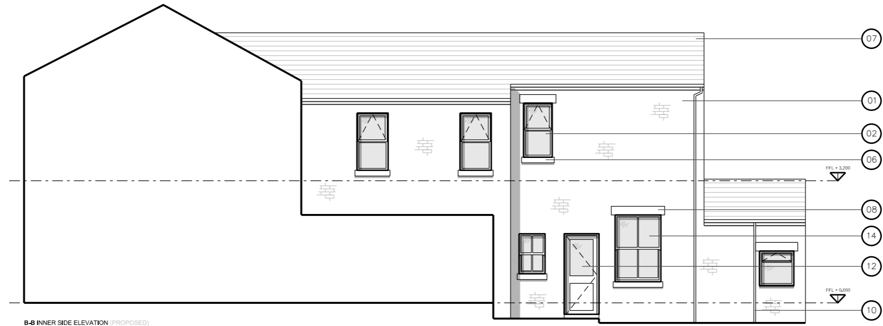
B-B INNER SIDE ELEVATION (PROPOSED)