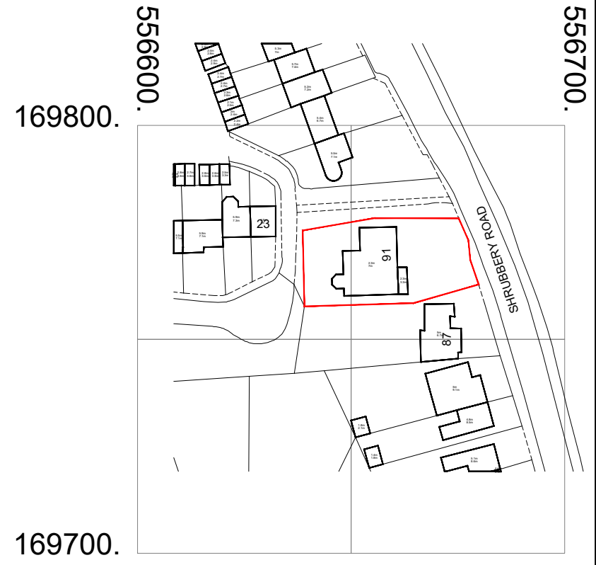
01 SITE/LOCATION PLAN SCALE 1:1250 @ A3 ©Crown Copyright and database rights 2024 Ordnance Survey License: 0100031673 Reproduction in whole or part is prohibited without the prior permission of Ordnance Survey