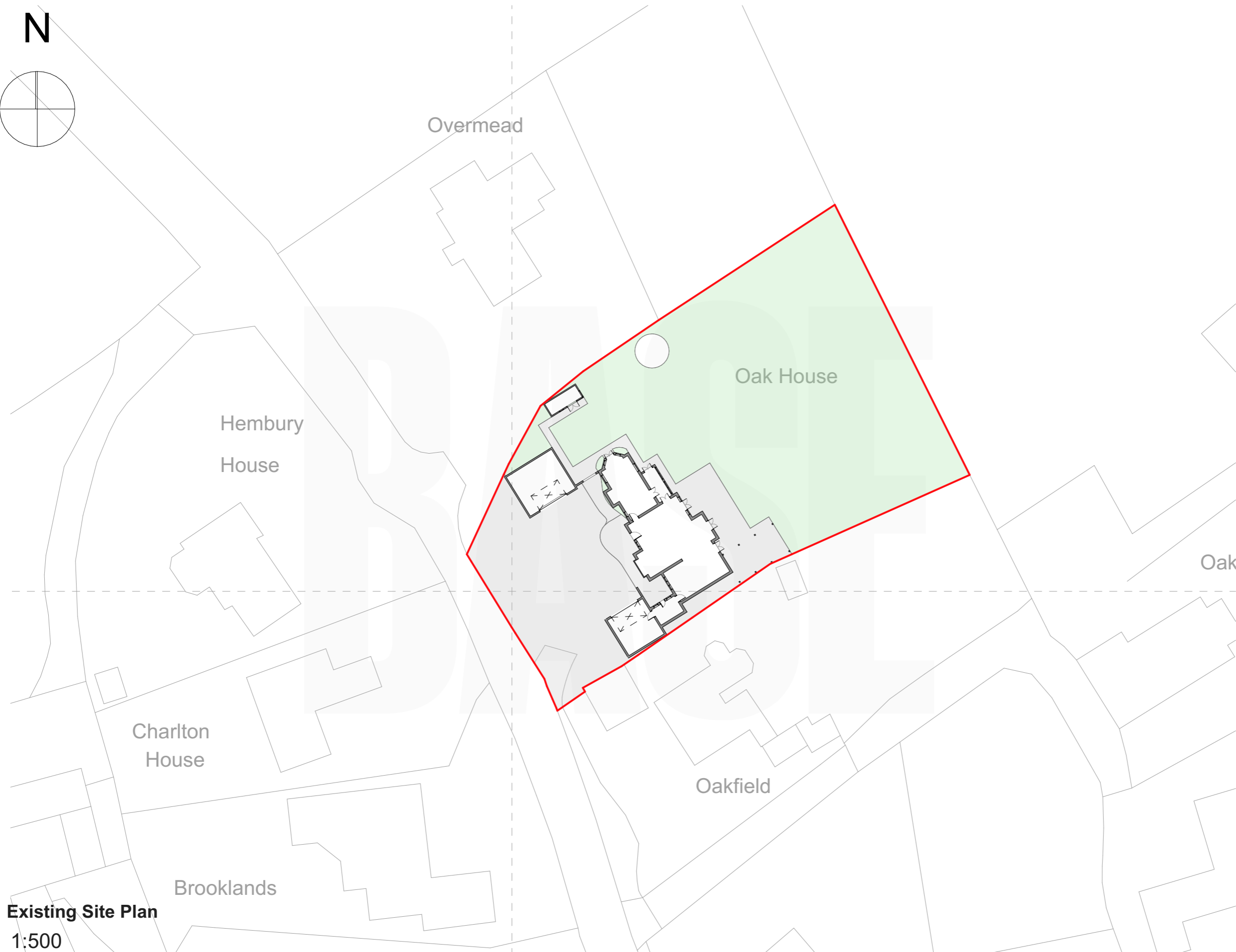
Existing Site Plan 1:500