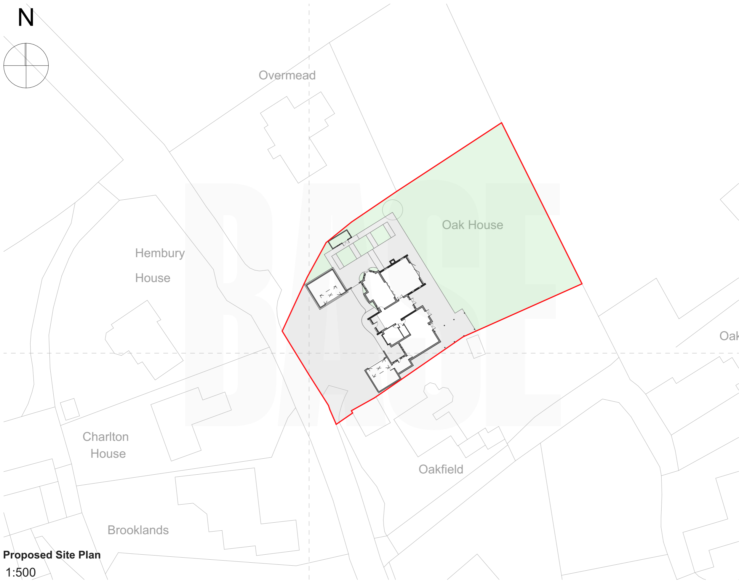
Proposed Site Plan 1:500