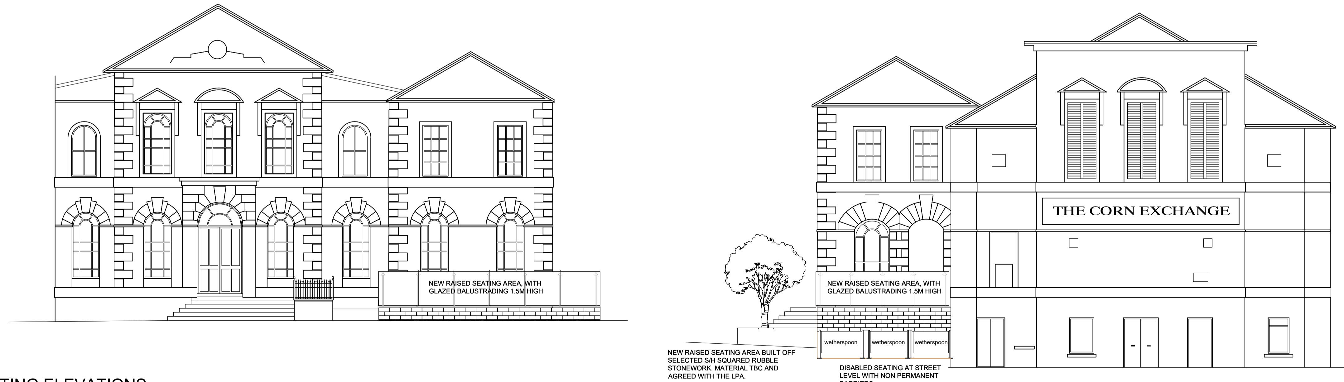
EXISTING ELEVATIONS SCALE 1:100