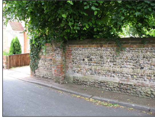
SECTION OF BOUNDARY WALL BEFORE COLLAPSE. NOTE: BRICK BANDING DETAIL IS DIFFERENT IN THIS BAY. APPLIED PIER WILL NOT BE REINSTATED.