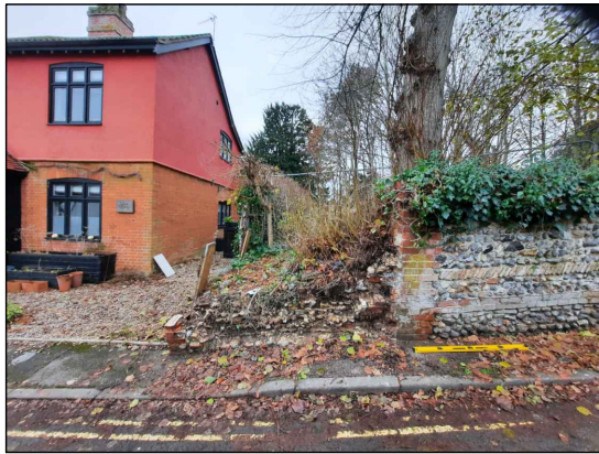
SECTION OF COLLAPSED BOUNDARY WALL ADJACENT TO 6 BARN STREET.