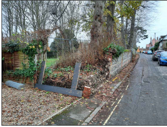
SECTION OF COLLAPSED BOUNDARY WALL AGAINST 6 BARN STREET.