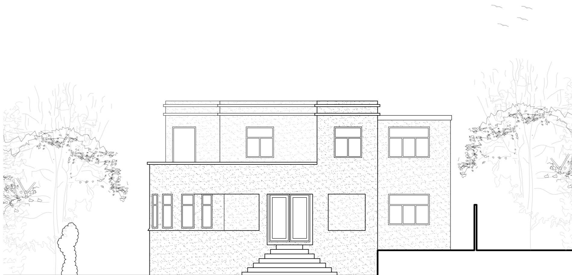
Existing South West Elevation 1:100