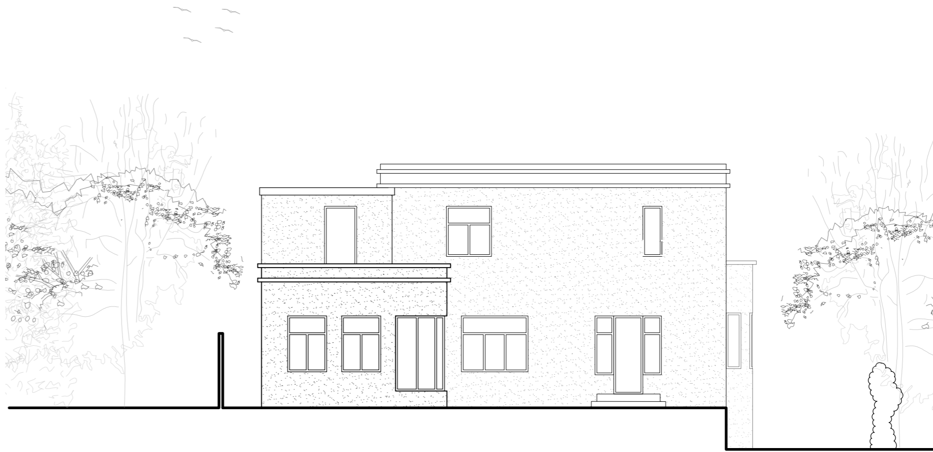
Existing North East Elevation 1:100