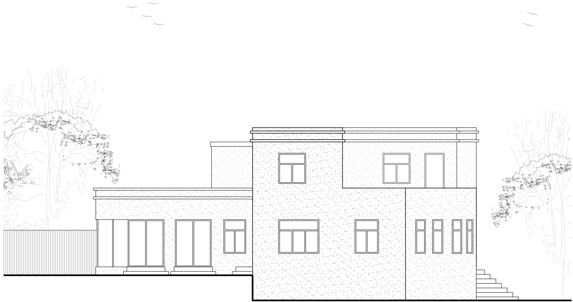
Existing North West Elevation 1:100