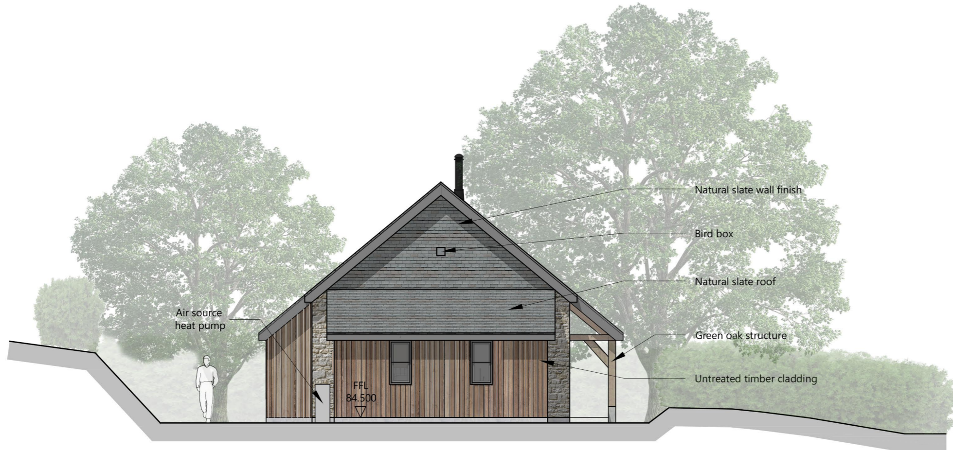
East Elevation 1:100