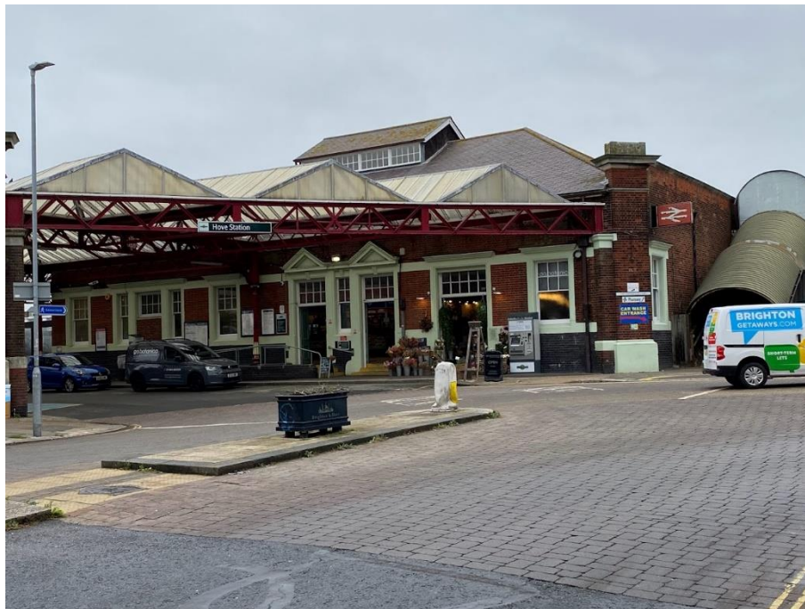
Figure 1. Hove Station

Enhancement of the electrical supply to provide additional capacity to supply the Help Point