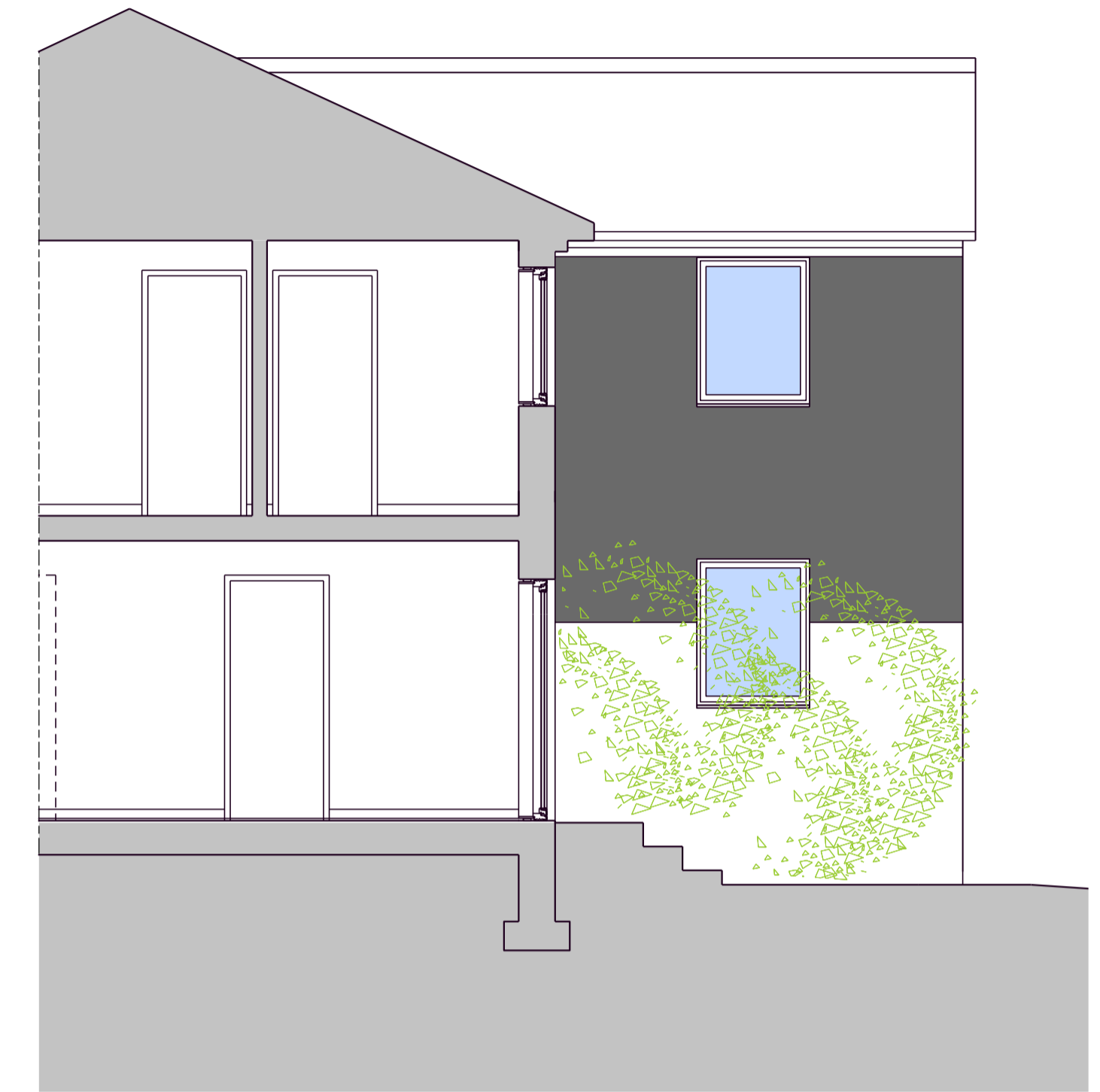
3 Existing Section A-A