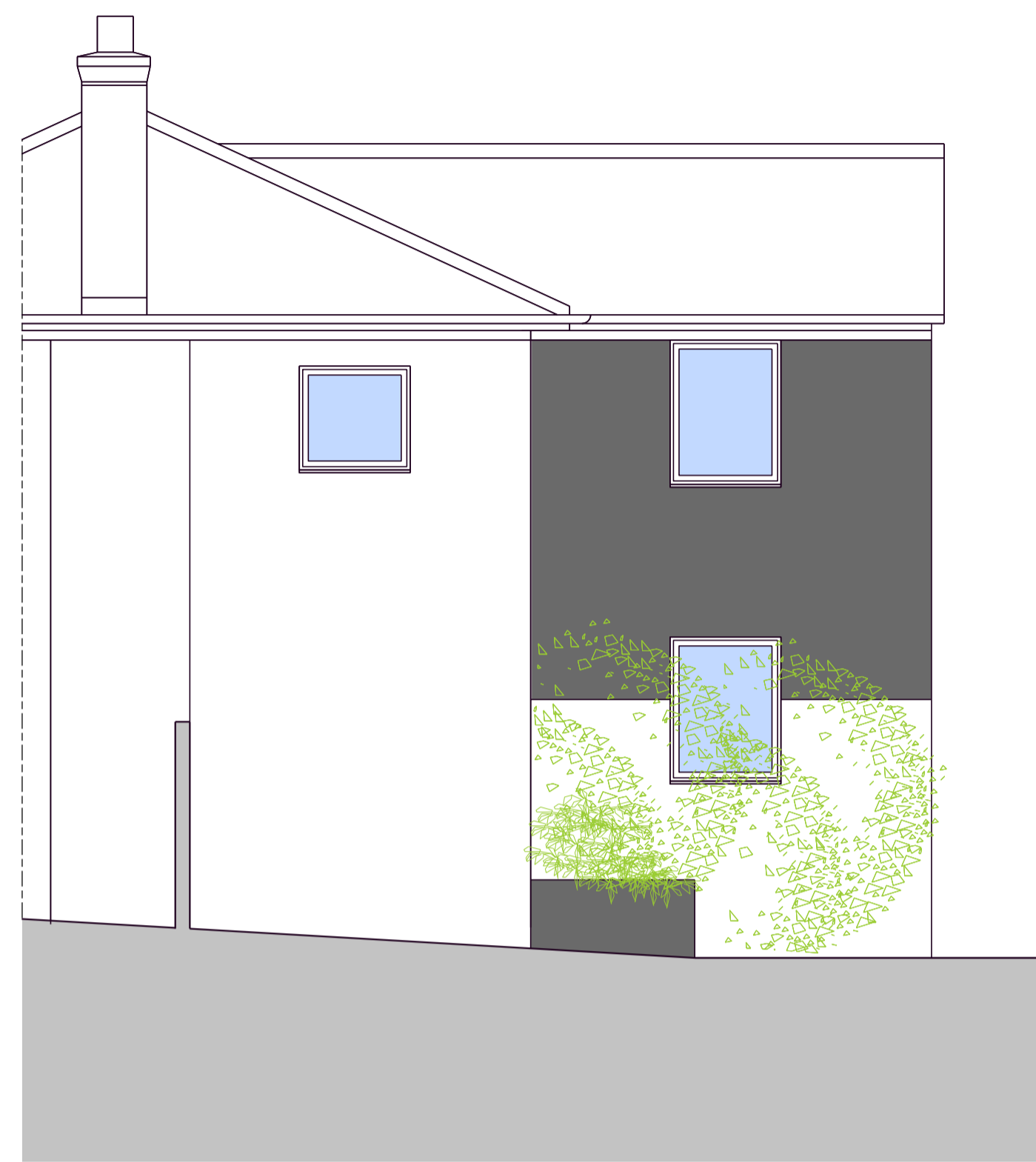
2 Existing Side / West Elevation