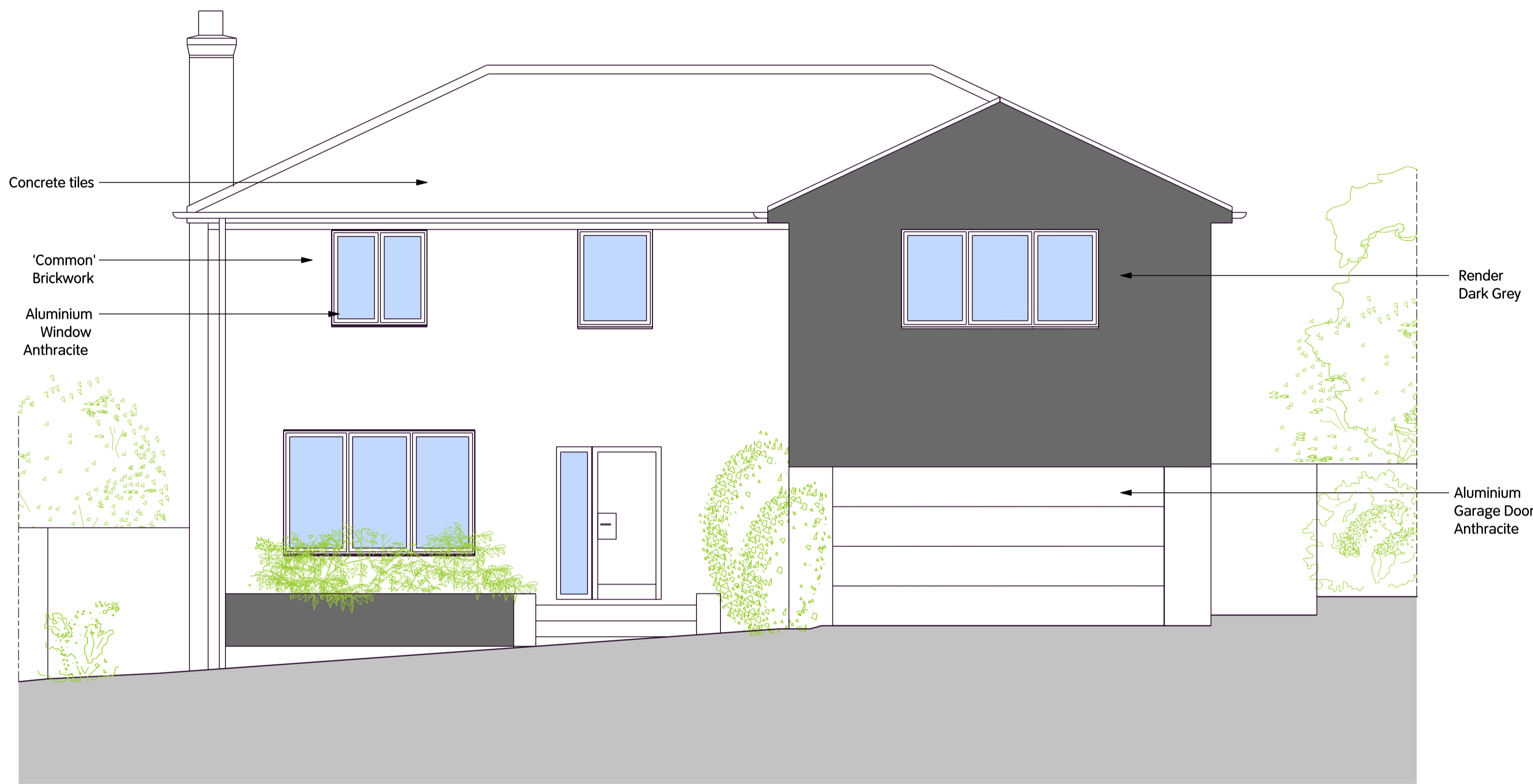
1 Existing Front / South Elevation