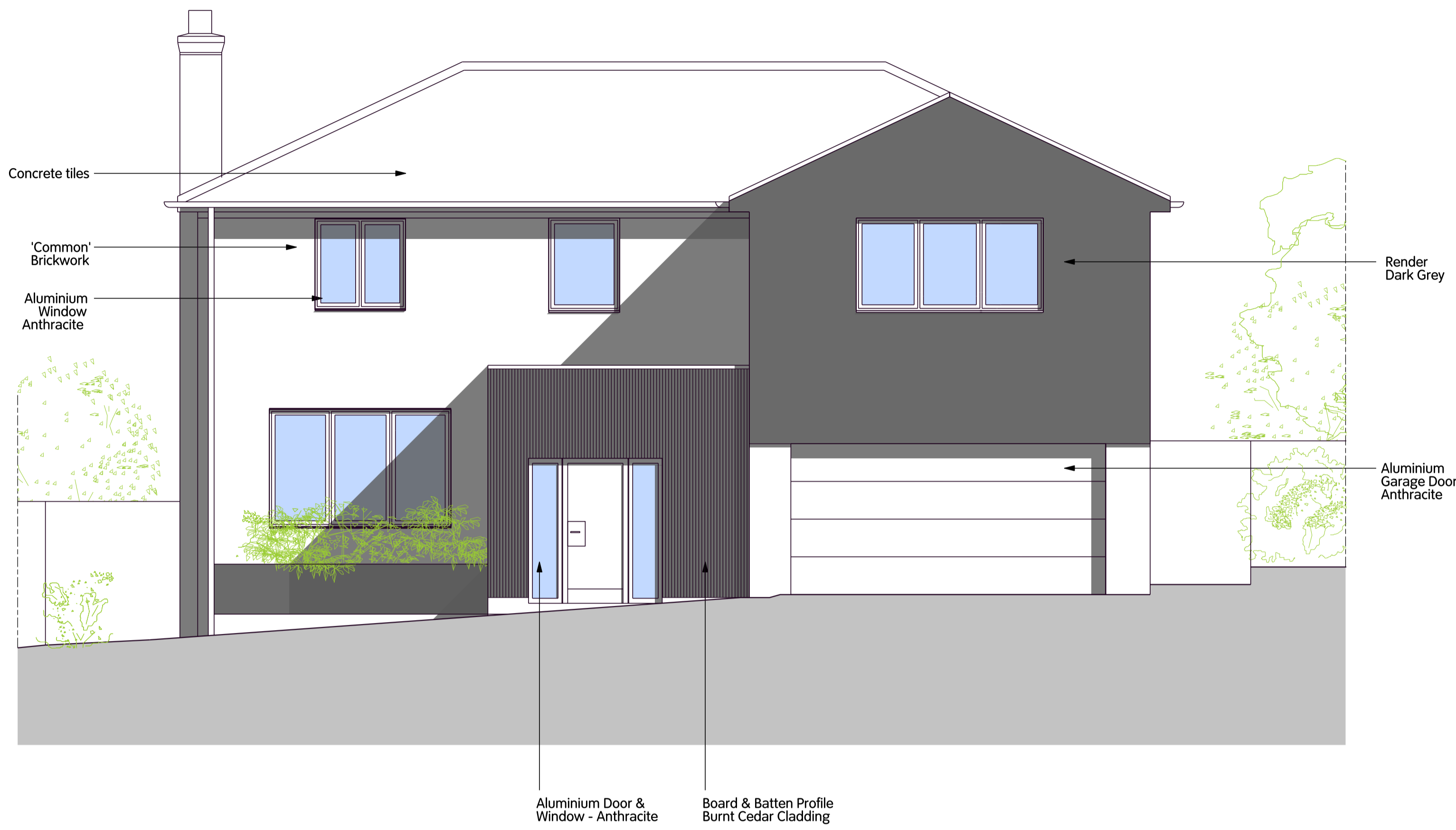
1 Proposed Front / South Elevation