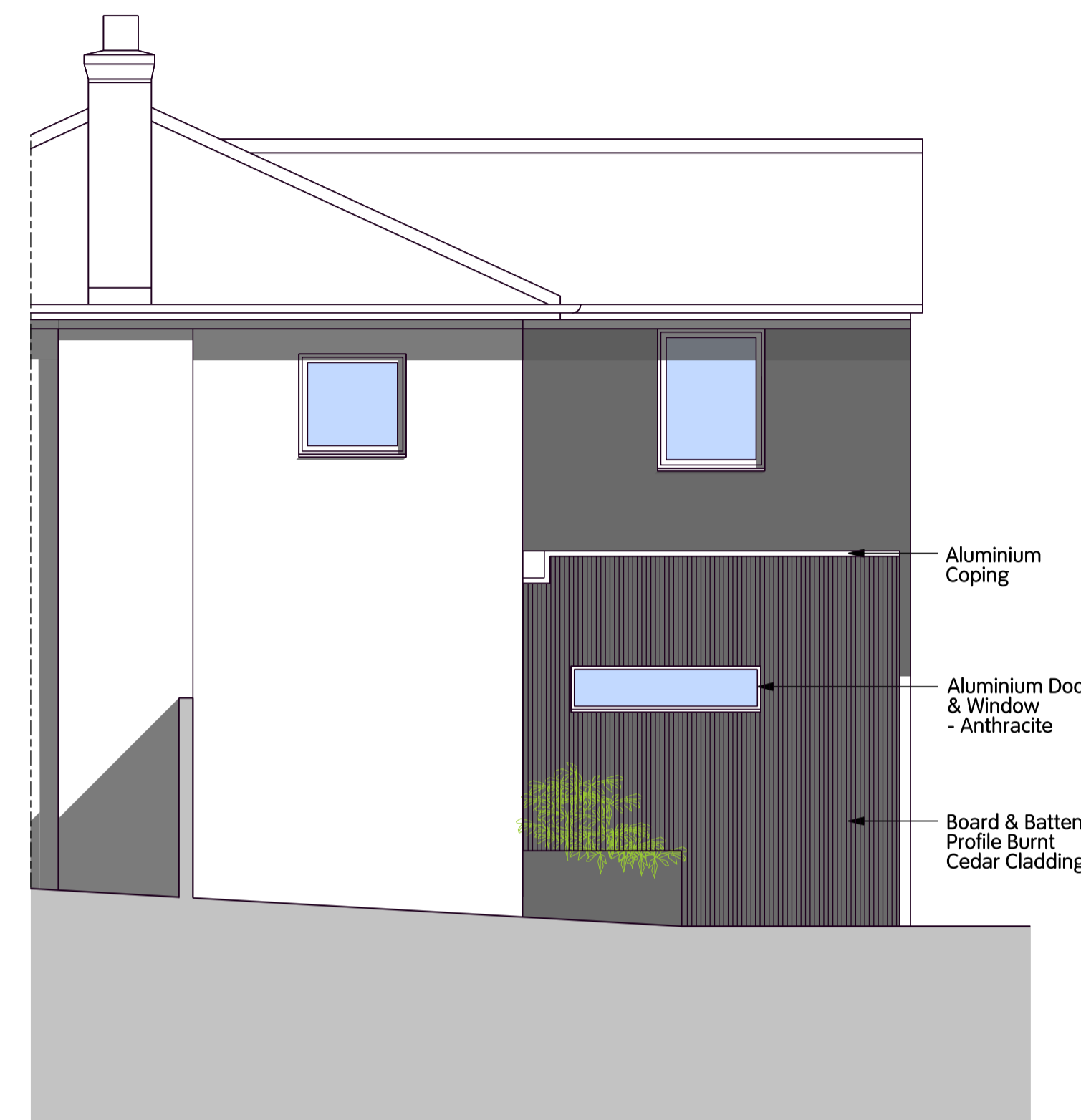
2 Proposed Side / West Elevation