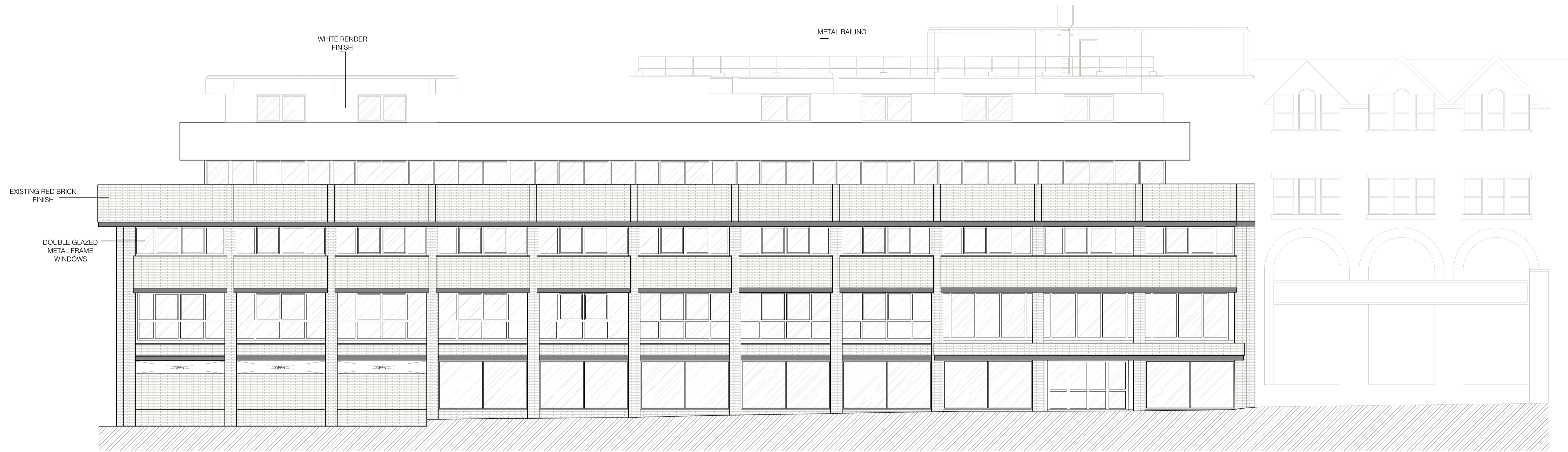
EXISTING ELEVATION D- SOUTH FACING