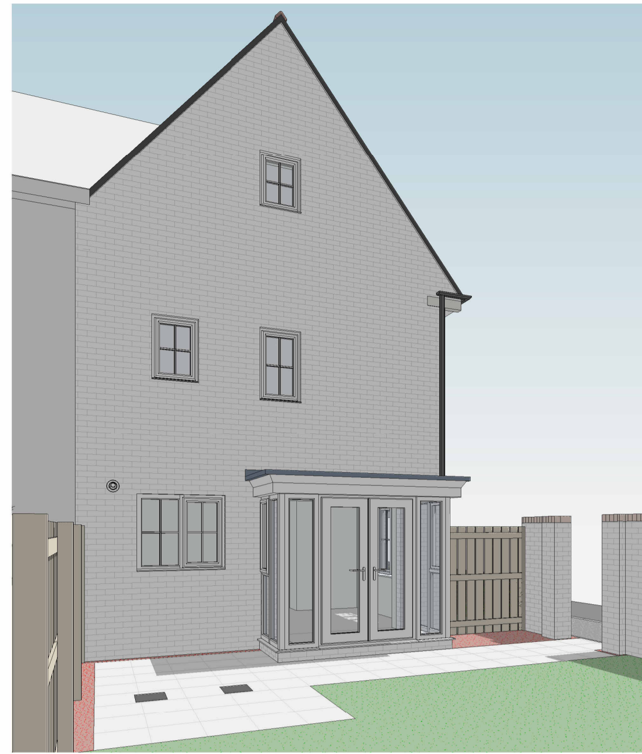
② Existing 3D View 2