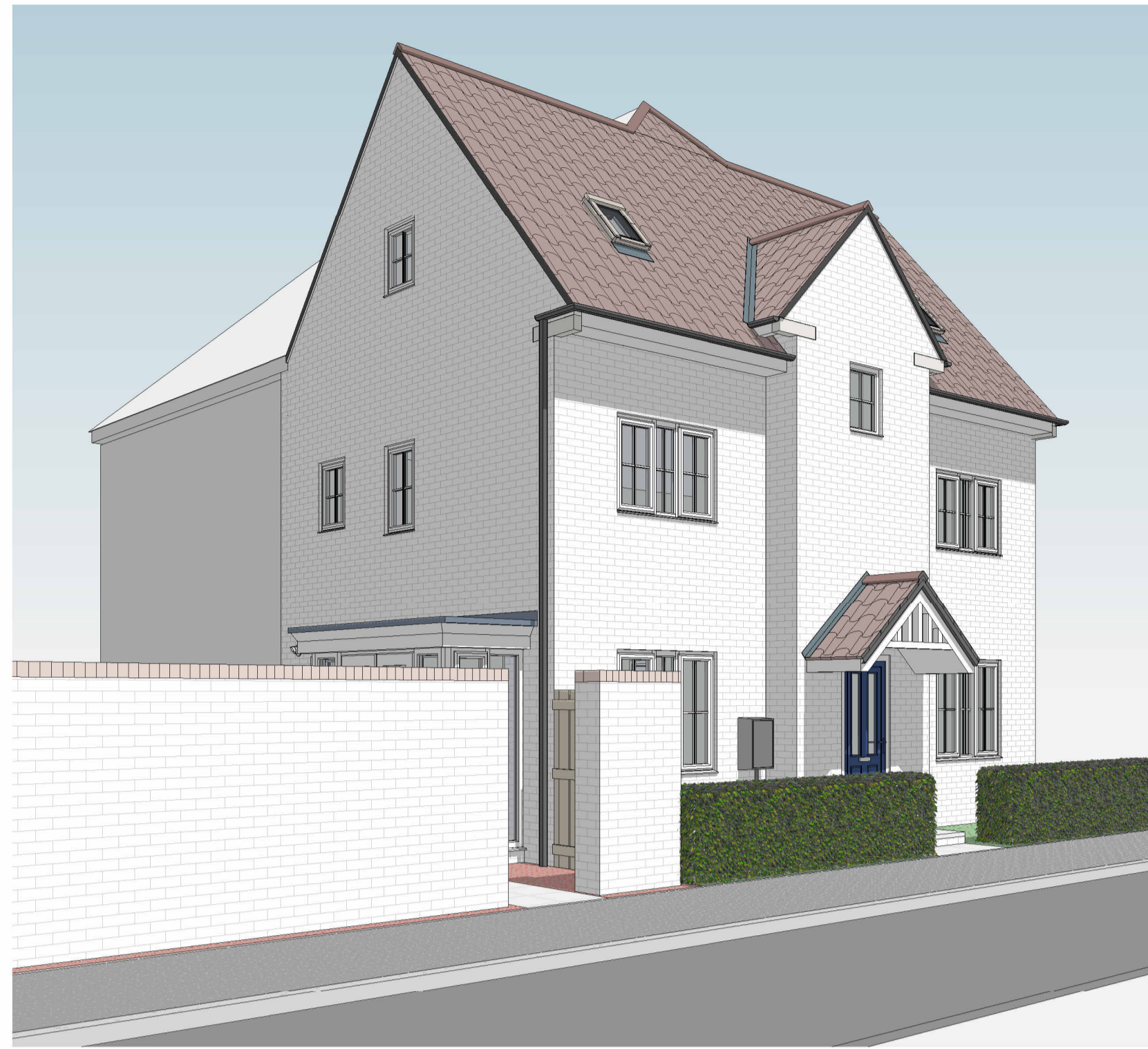
① Existing 3D View 1