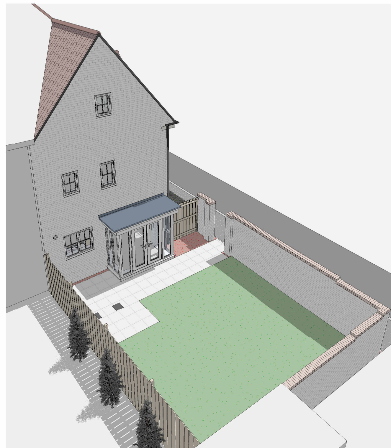
④ Existing 3D View 4