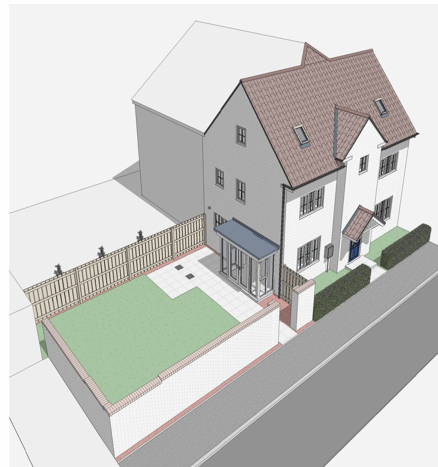
⑤ Existing 3D View 5