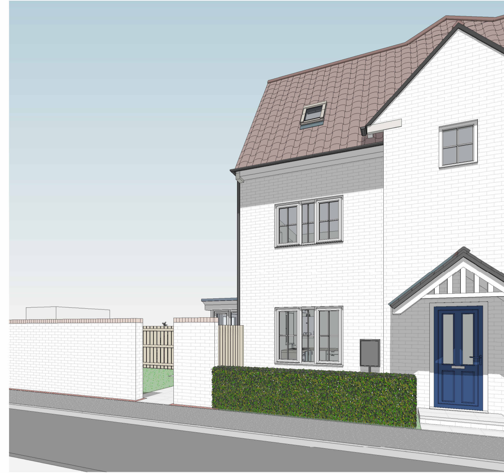
③ Existing 3D View 3