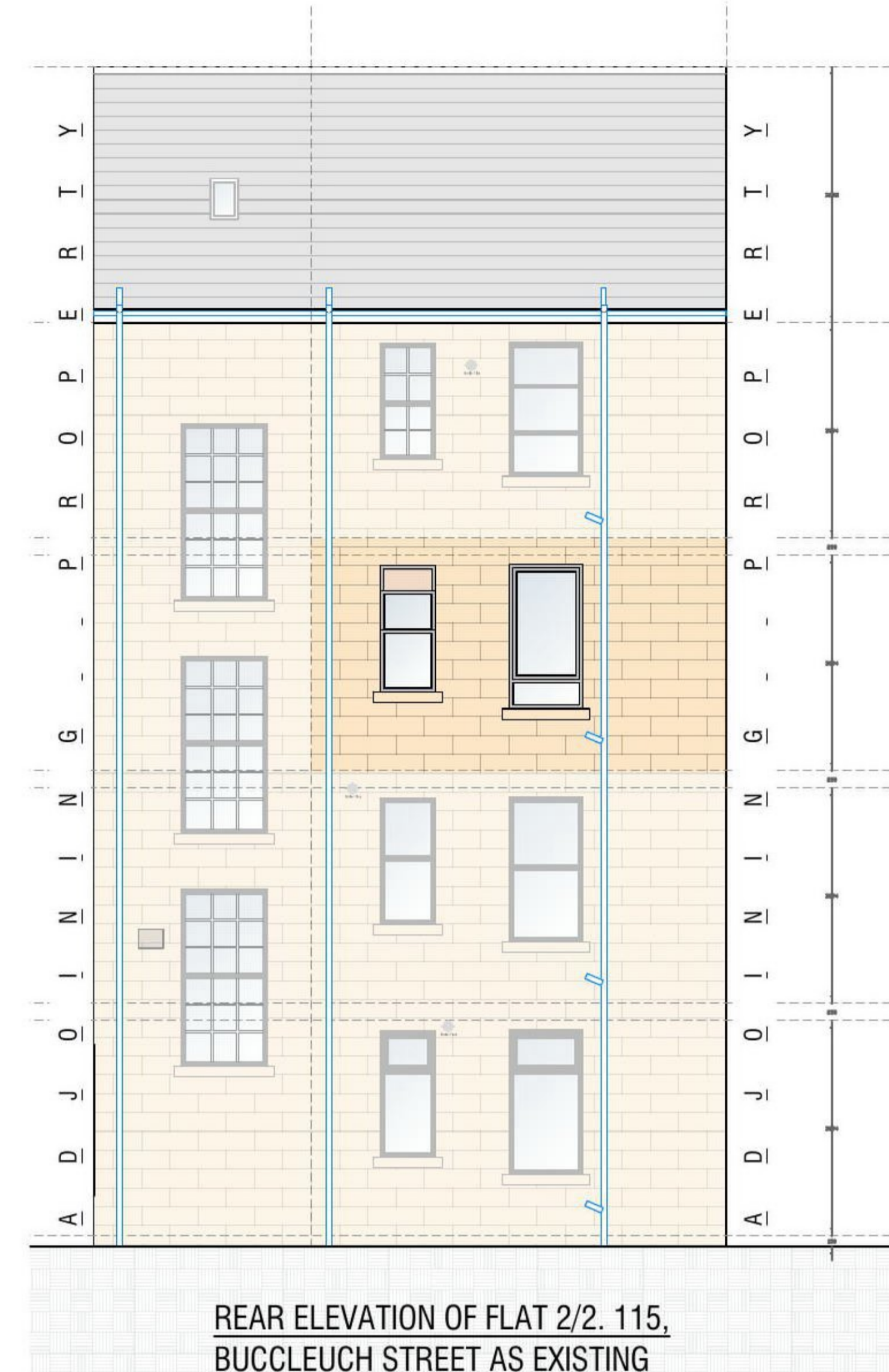
REAR ELEVATION OF FLAT 2/2, 115, BUCCLEUCH STREET AS EXISTING SCALE 1:50