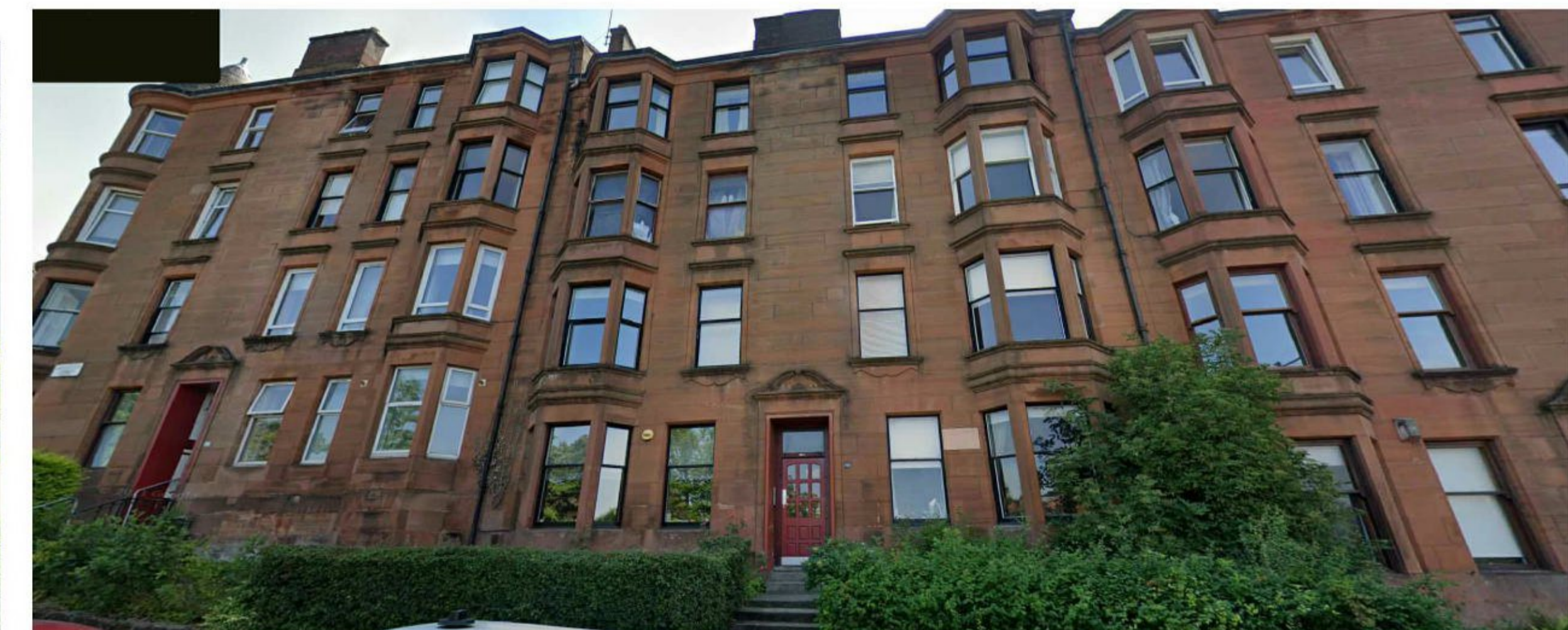
PHOTOGRAPH OF FRONT ELEVATION