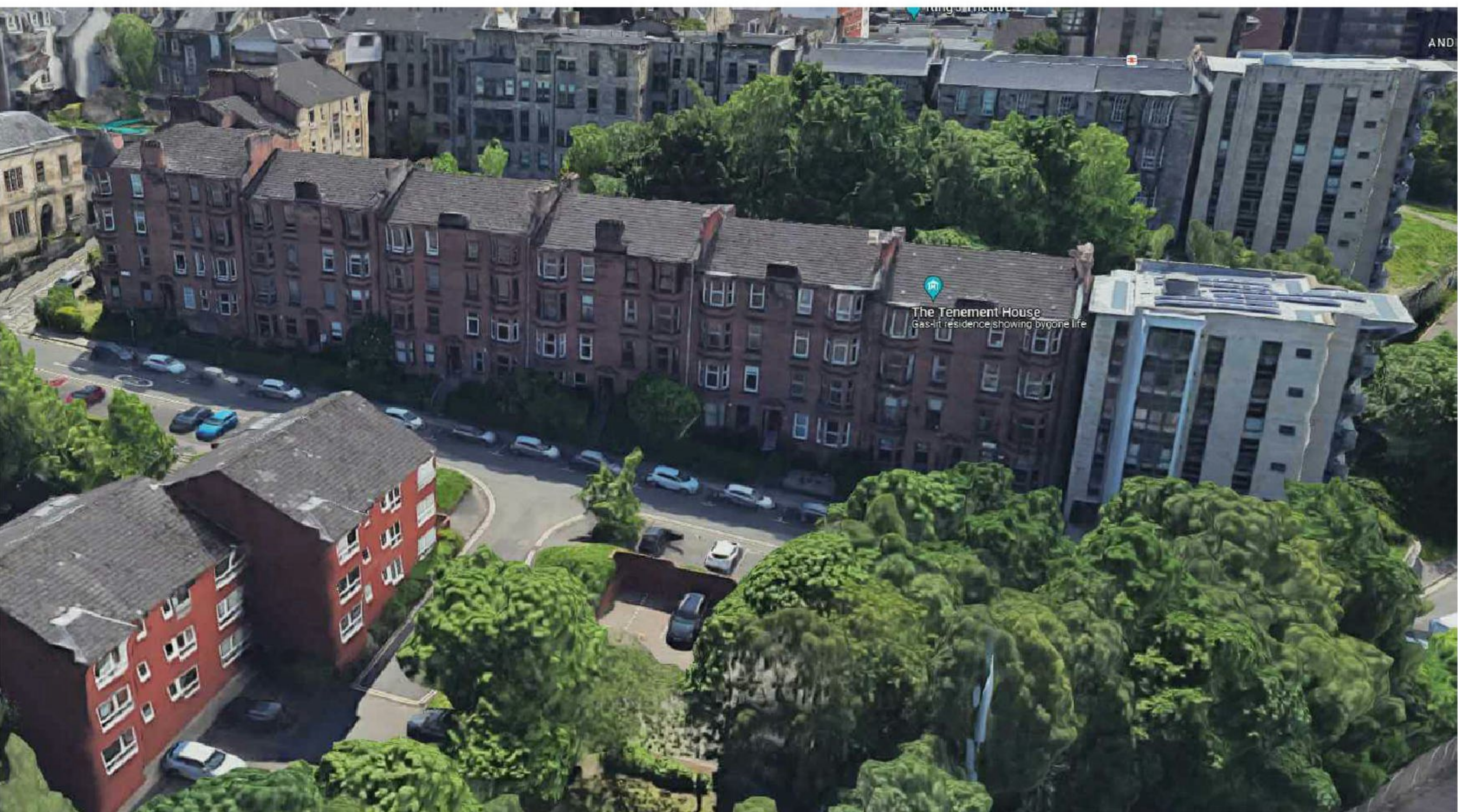
PHOTOGRAPH OF FRONT ROW OF TENEMENTS