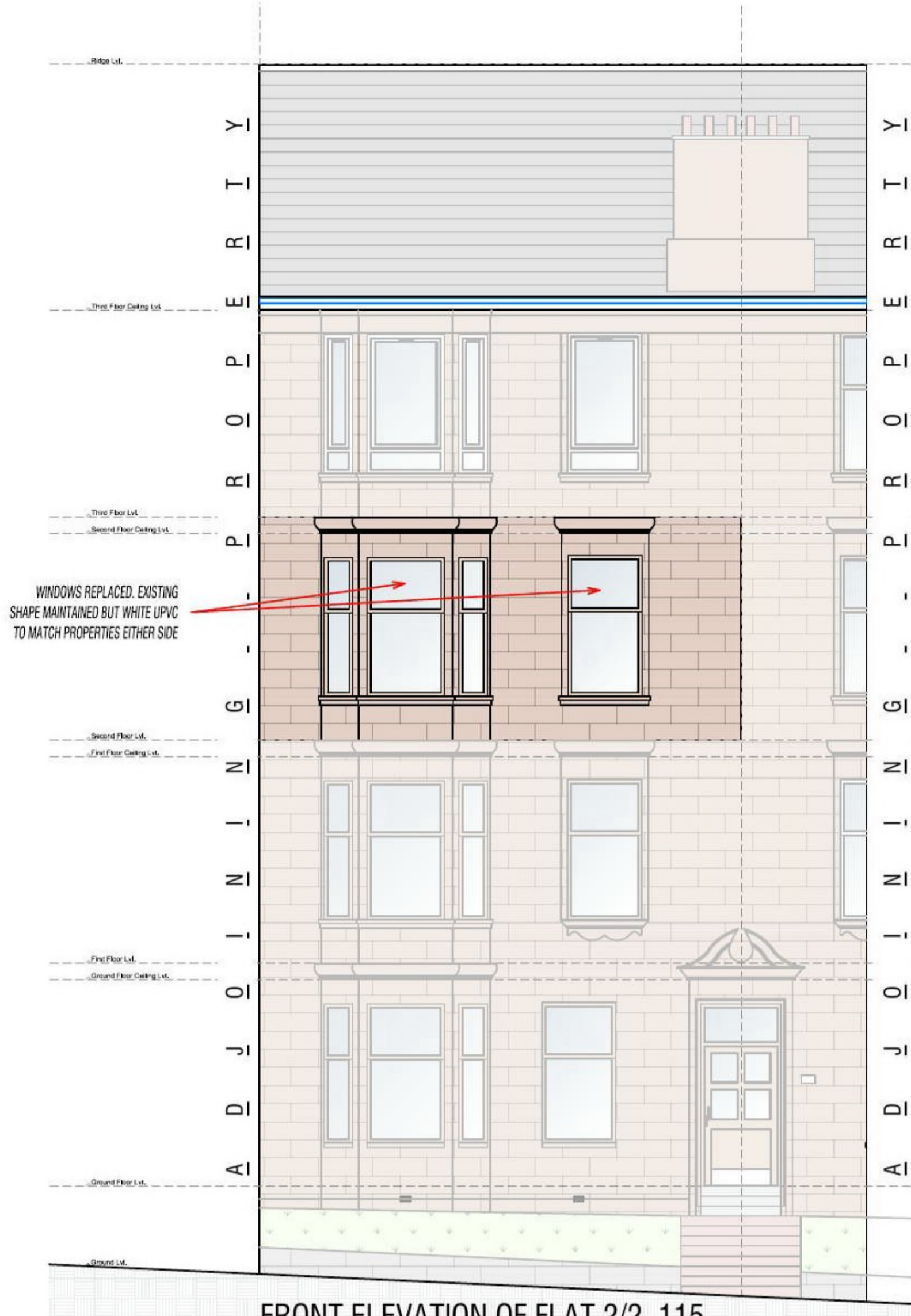
FRONT ELEVATION OF FLAT 2/2, 115, BUCCLEUCH STREET AS PROPOSED SCALE 1:50