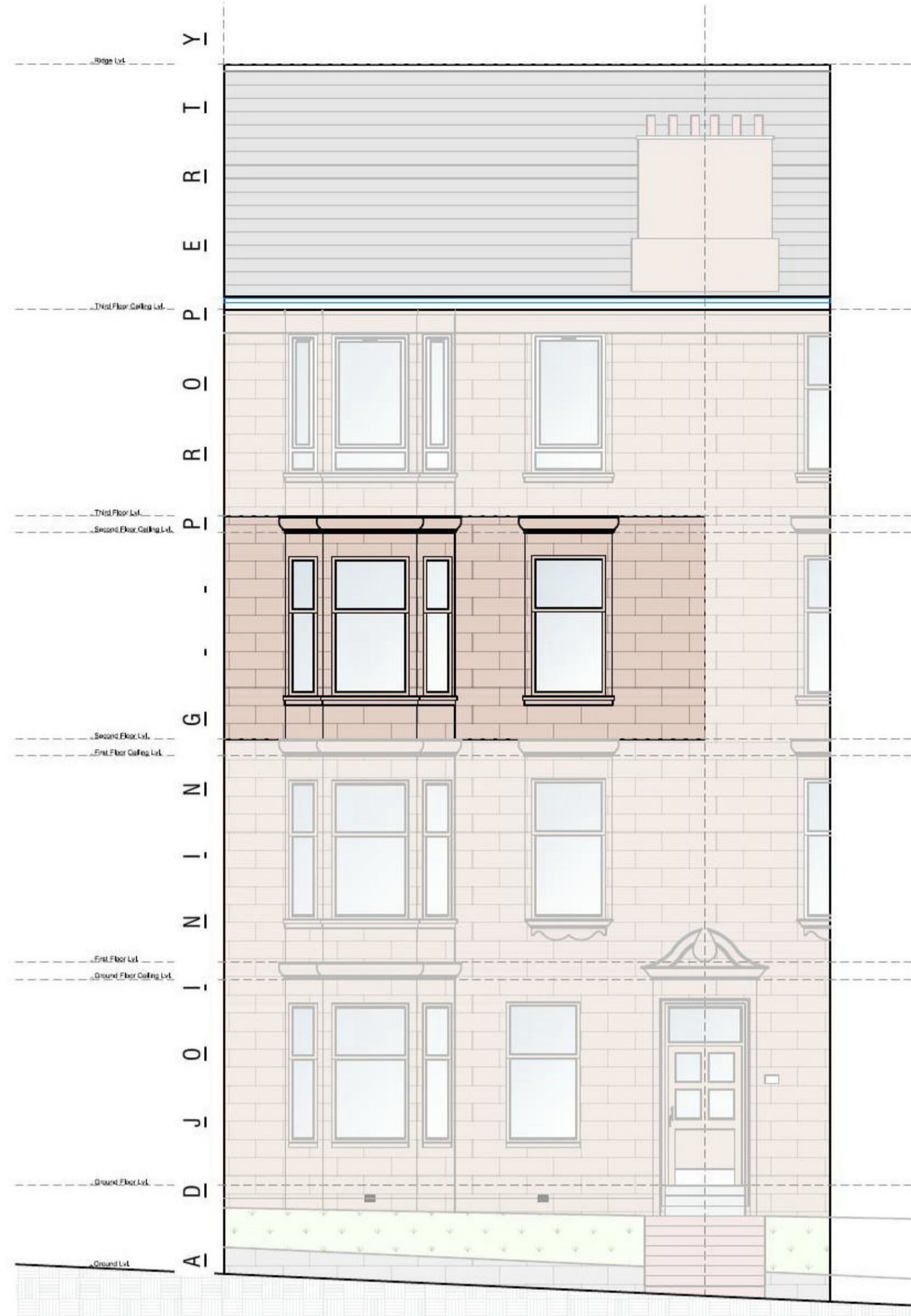
FRONT ELEVATION OF FLAT 2/2, 115, BUCCLEUCH STREET AS EXISTING SCALE 1:50