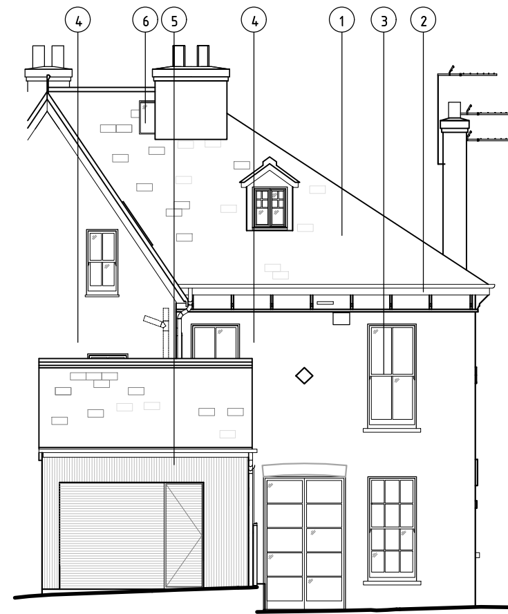
EXISTING REAR ELEVATION SCALE 1:100 @ A3