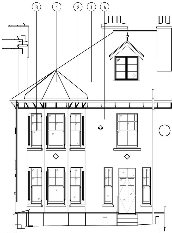
EXISTING FRONT ELEVATION SCALE 1:100 @ A3