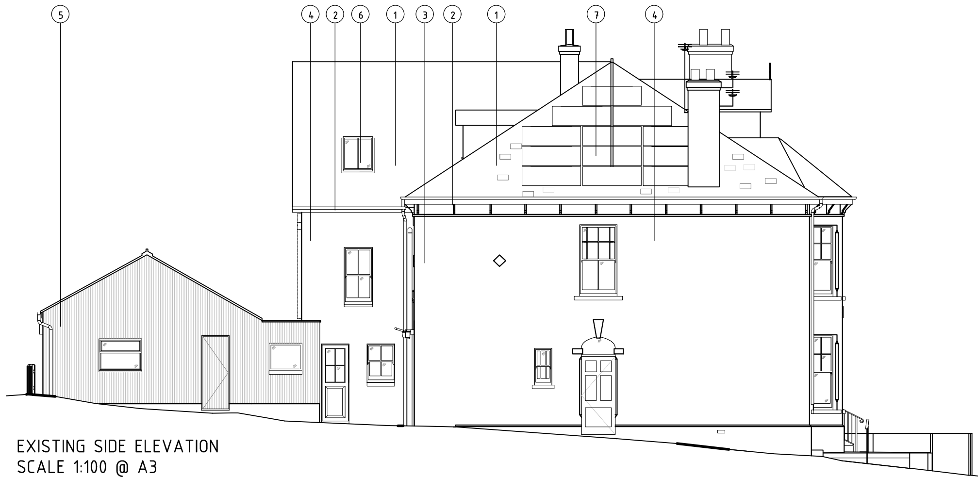
EXISTING SIDE ELEVATION SCALE 1:100 @ A3