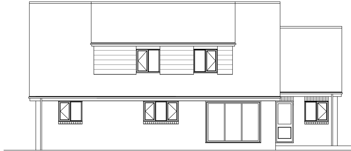
REAR ELEVATION PLOT 1