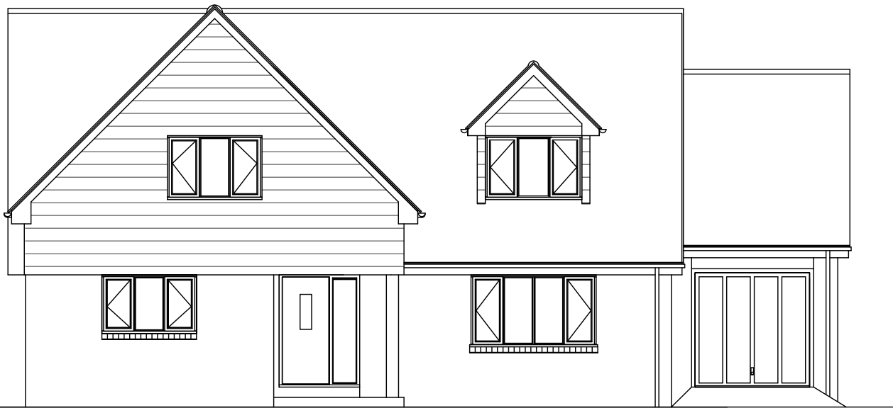
FRONT ELEVATION PLOT 2