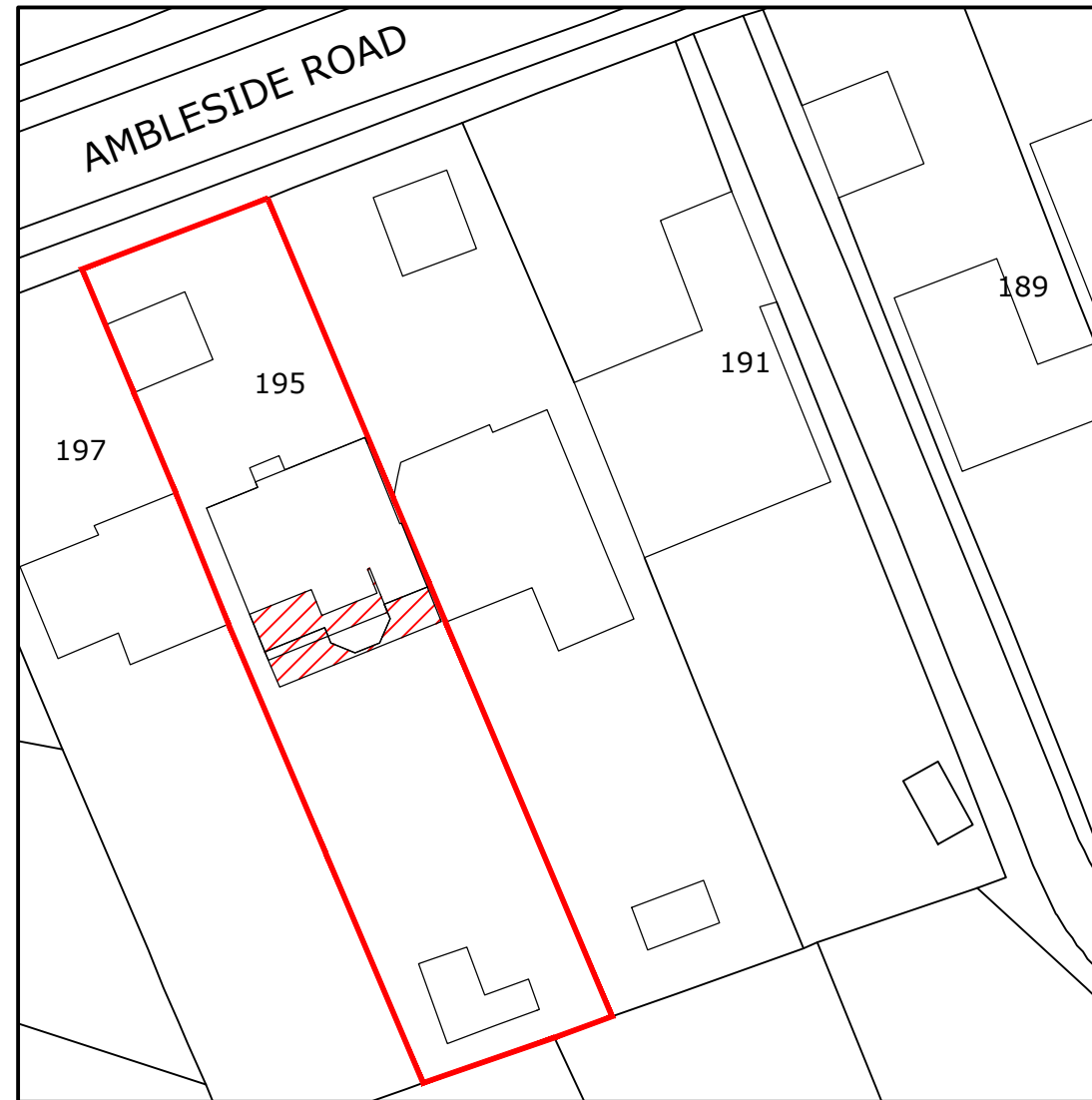
SITE PLAN - PROPOSED SHOWN HATCHED SCALE 1:500