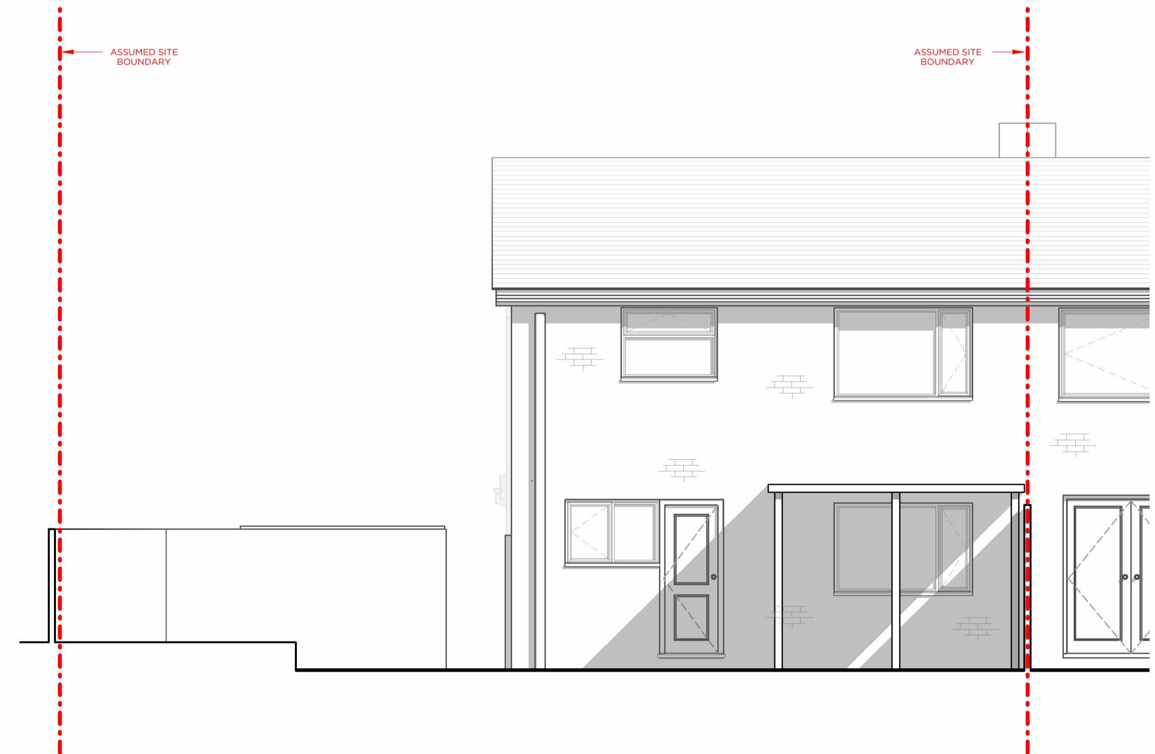
3 EXISTING NORTH-WEST ELEVATIONS Scale 1:50