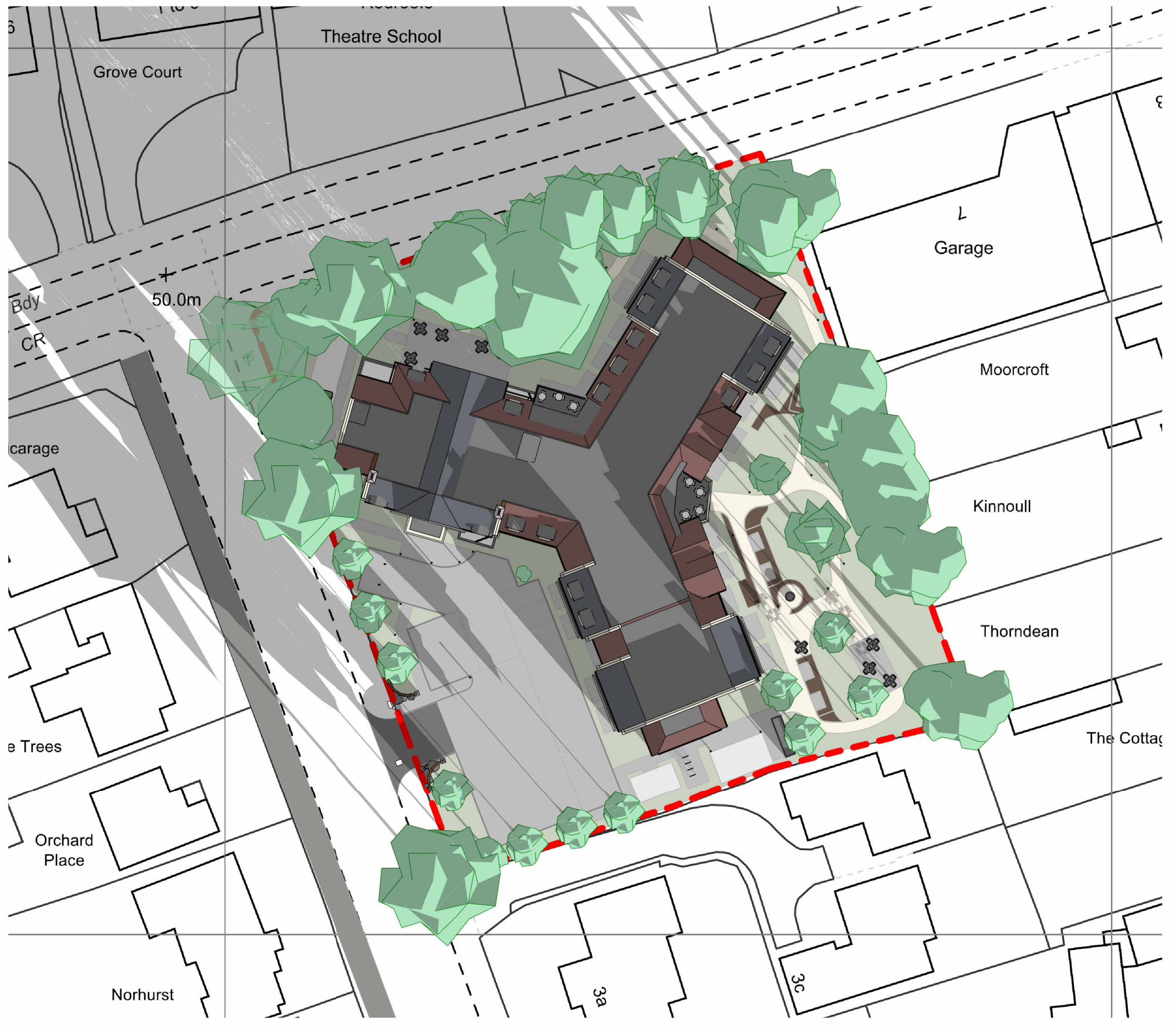
Proposed Site - Solar Study Dec 21st - 0900