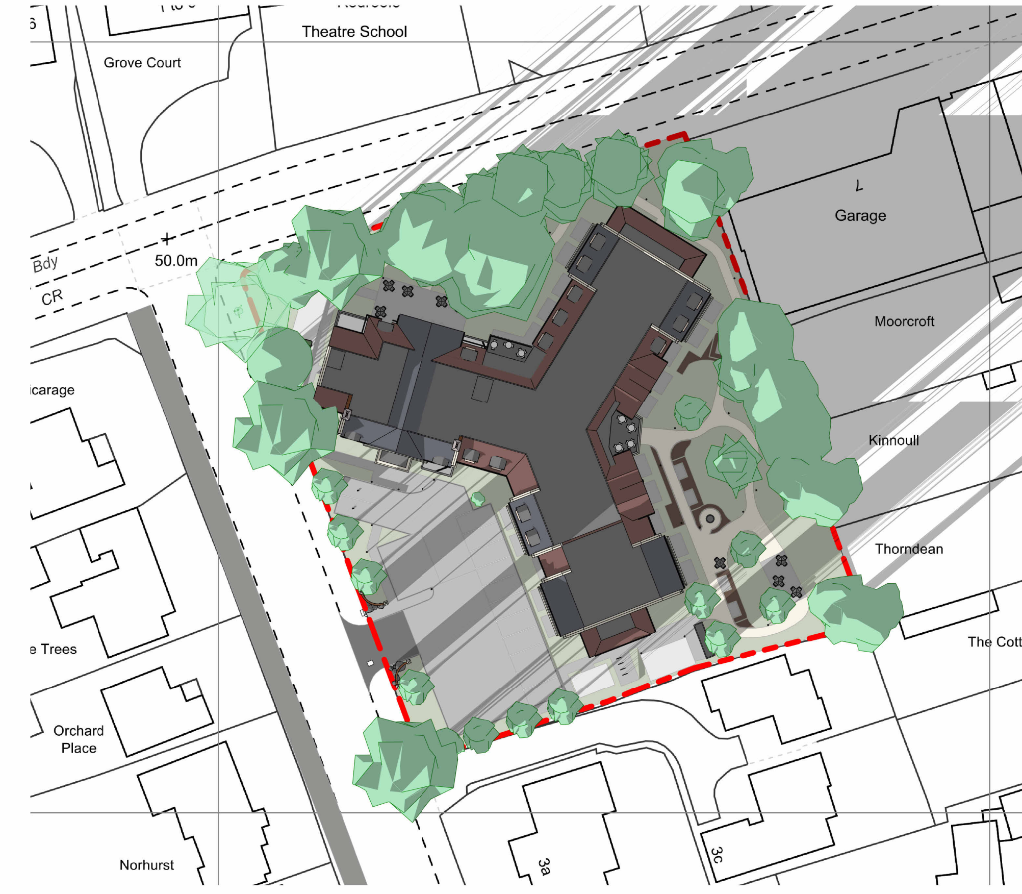
Proposed Site - Solar Study Dec 21st - 1600