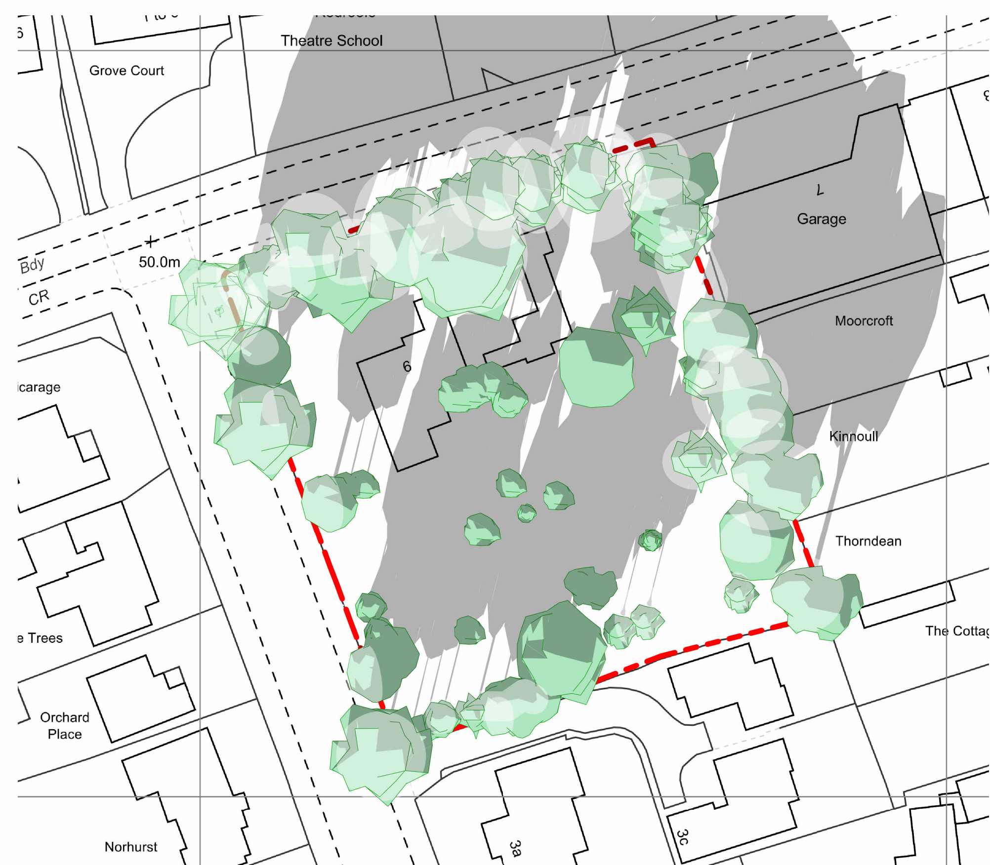
Existing Site - Solar Study Dec 21st - 1300