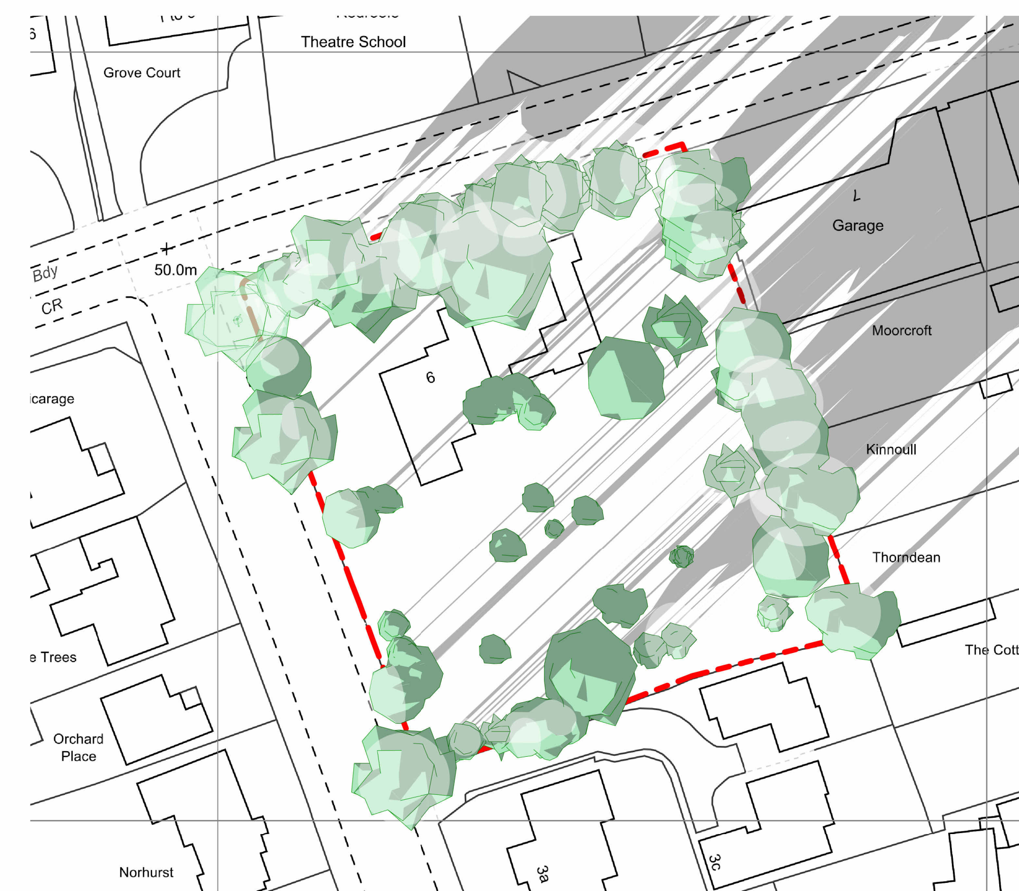
Existing Site - Solar Study Dec 21st - 1600