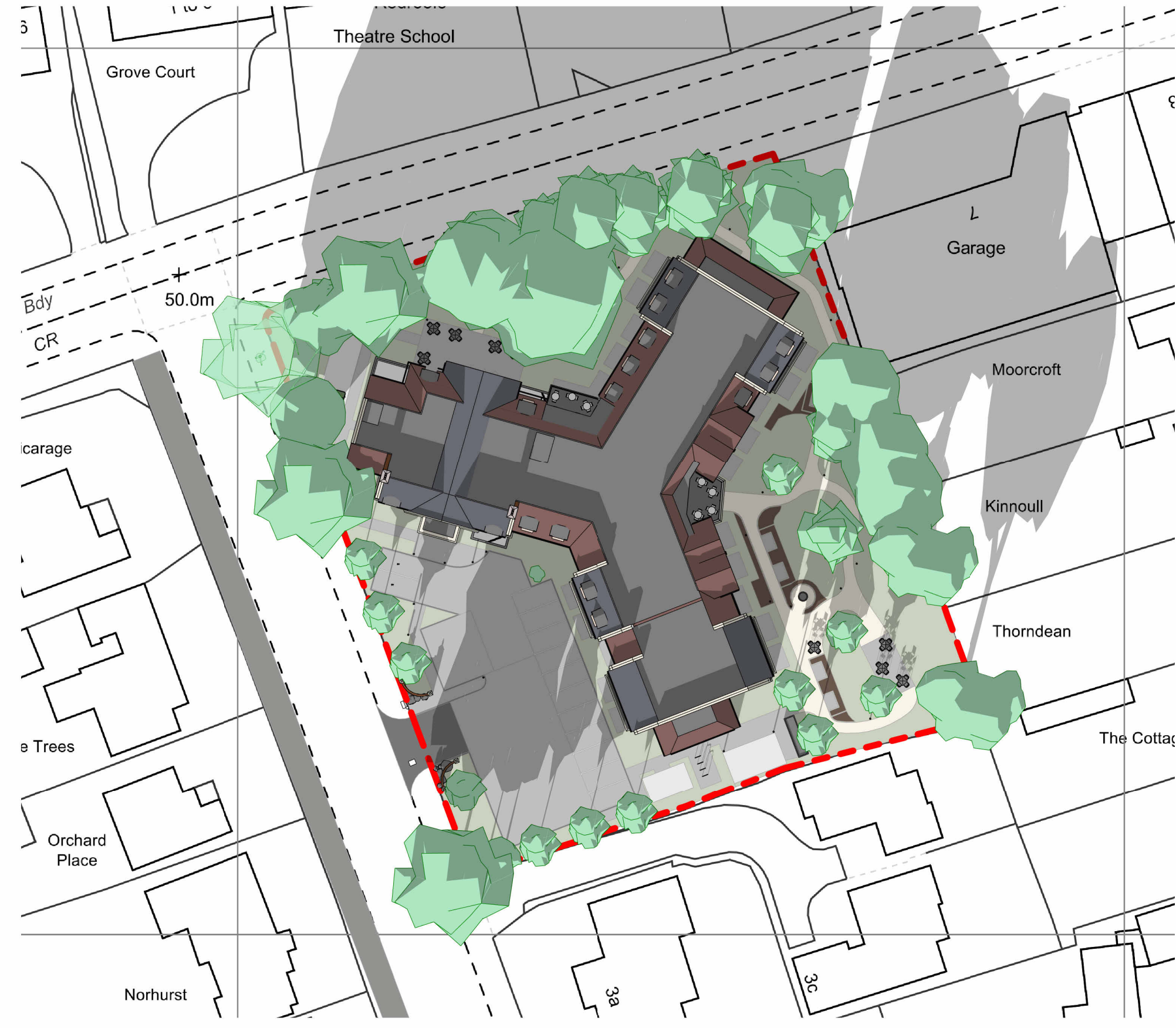
Proposed Site - Solar Study Dec 21st - 1300