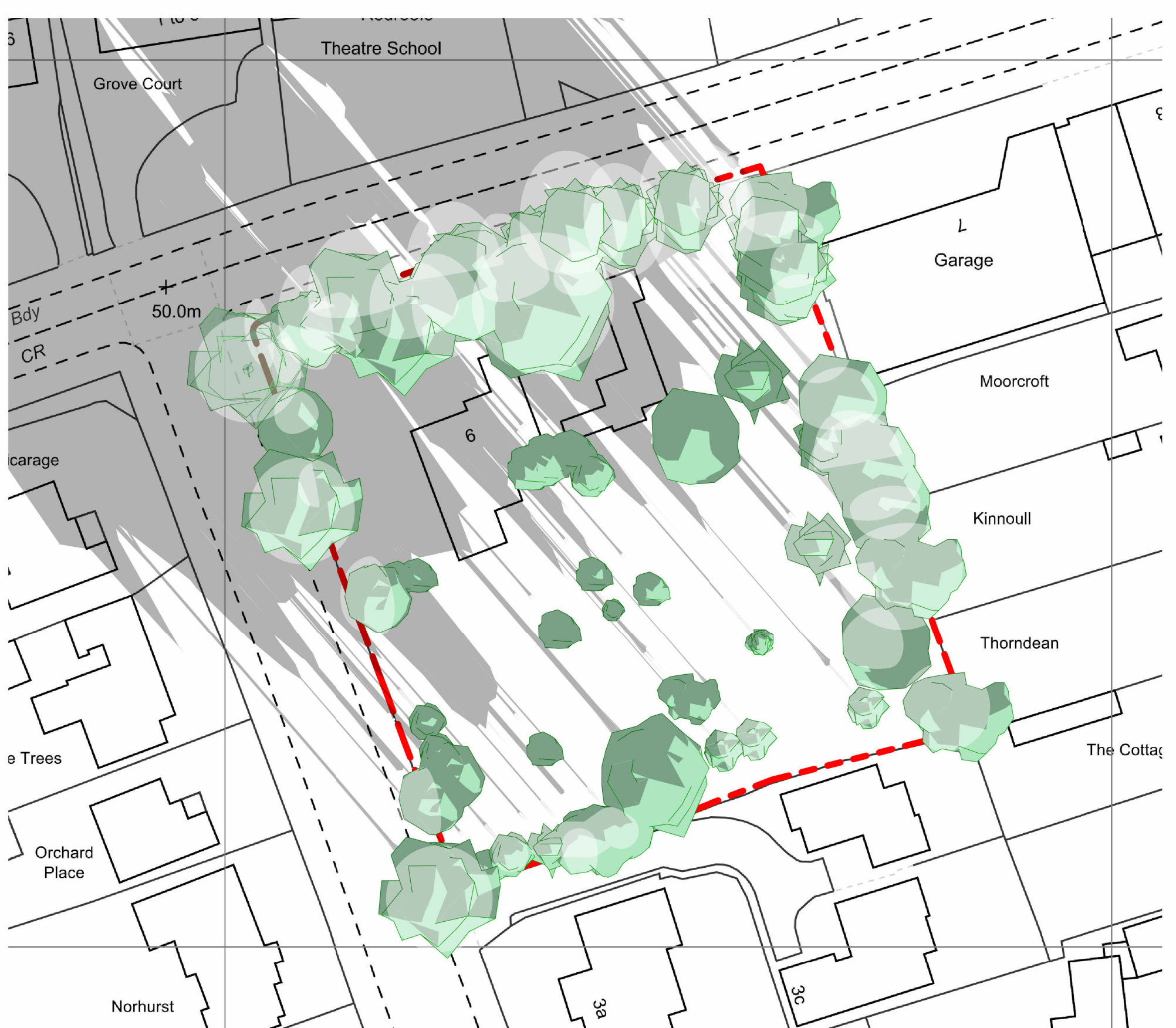
Existing Site - Solar Study Dec 21st - 0900