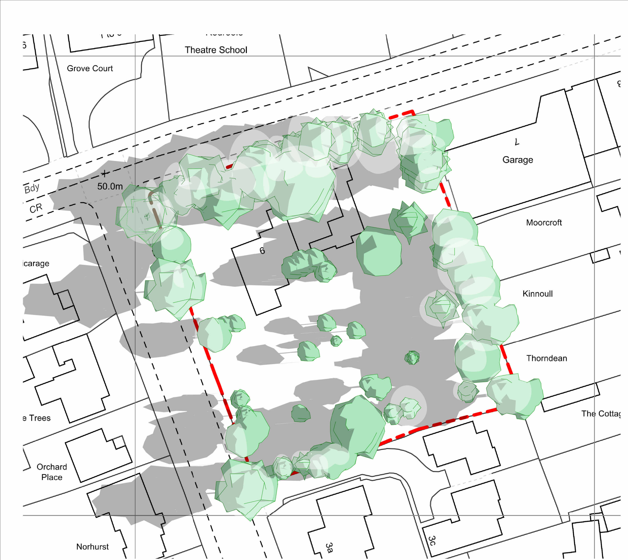
Existing Site - Solar Study June 21st - 0700