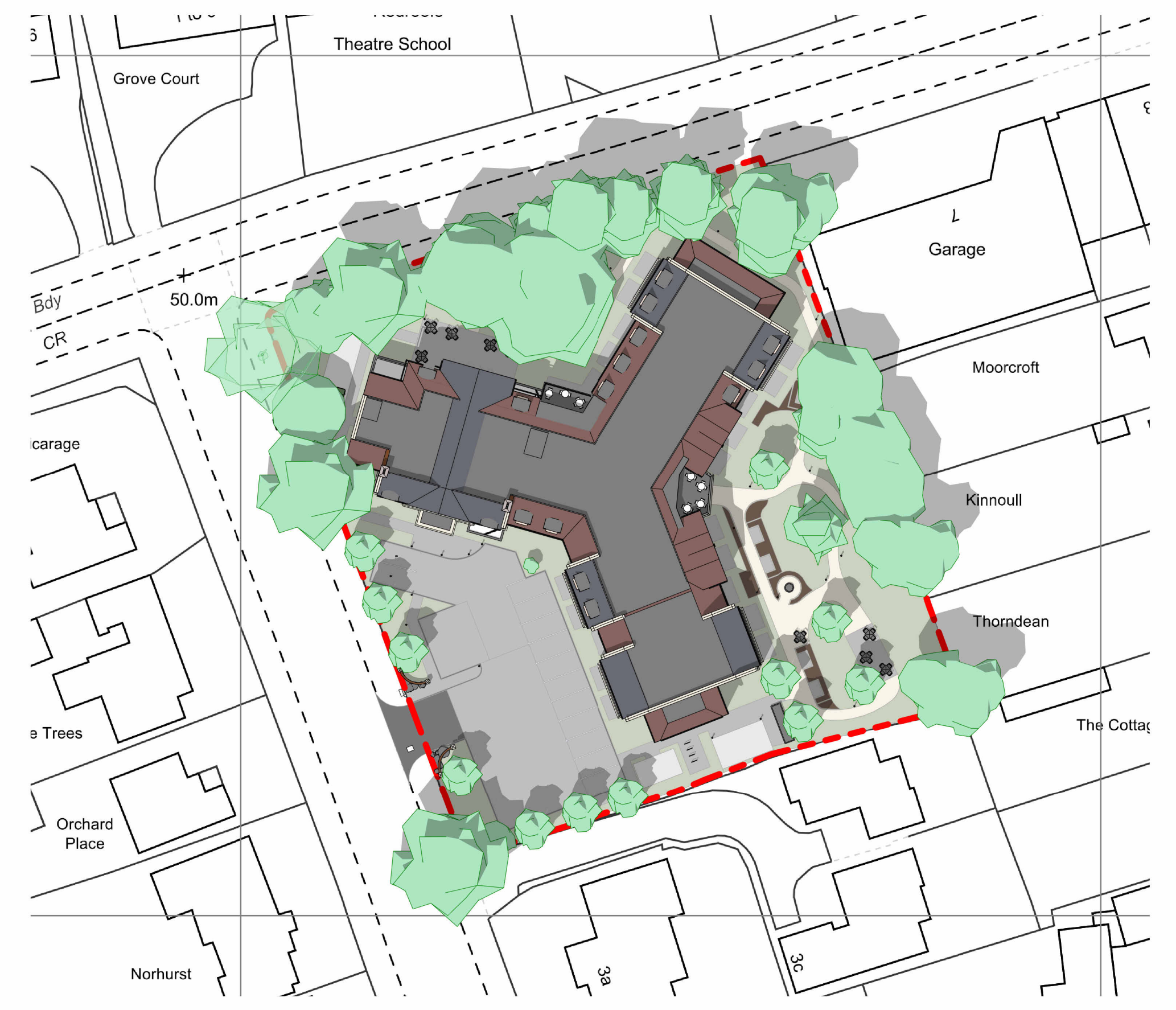
Proposed Site - Solar Study June 21st - 1300