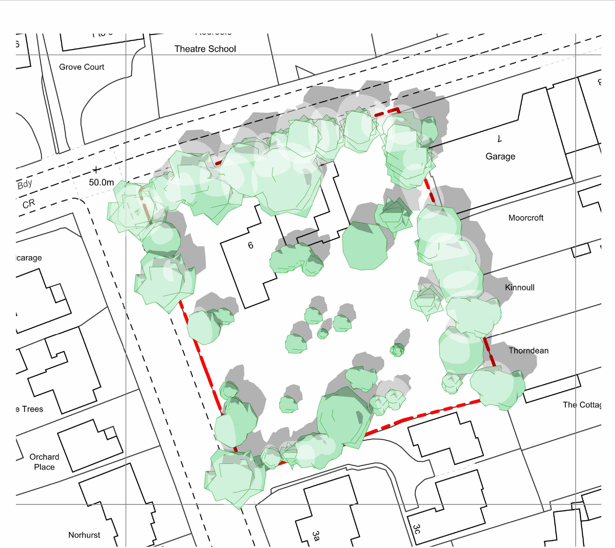
Existing Site - Solar Study June 21st - 1300