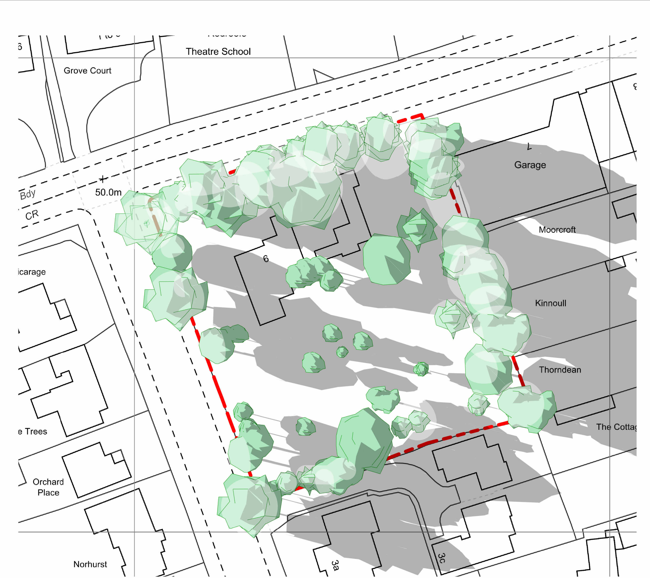
Existing Site - Solar Study June 21st - 1800