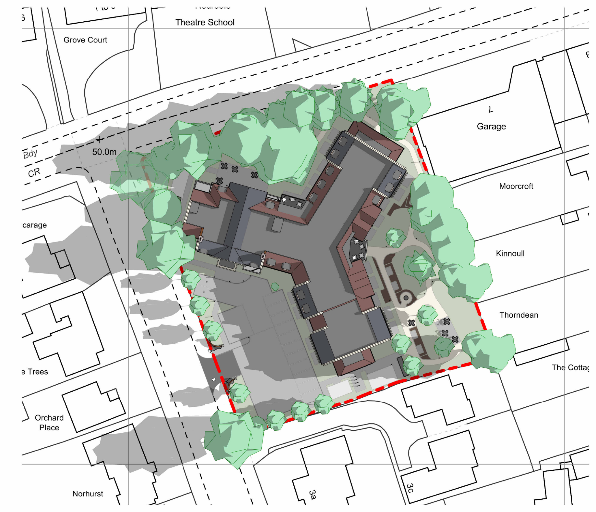
Proposed Site - Solar Study June 21st - 0700