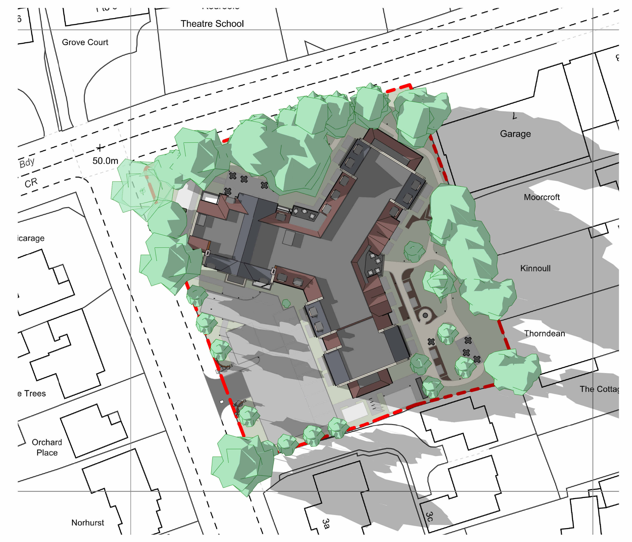
Proposed Site - Solar Study June 21st - 1800