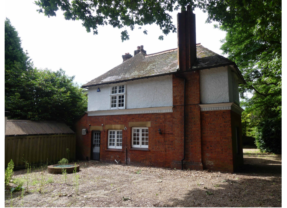
4 Building to be Demolished