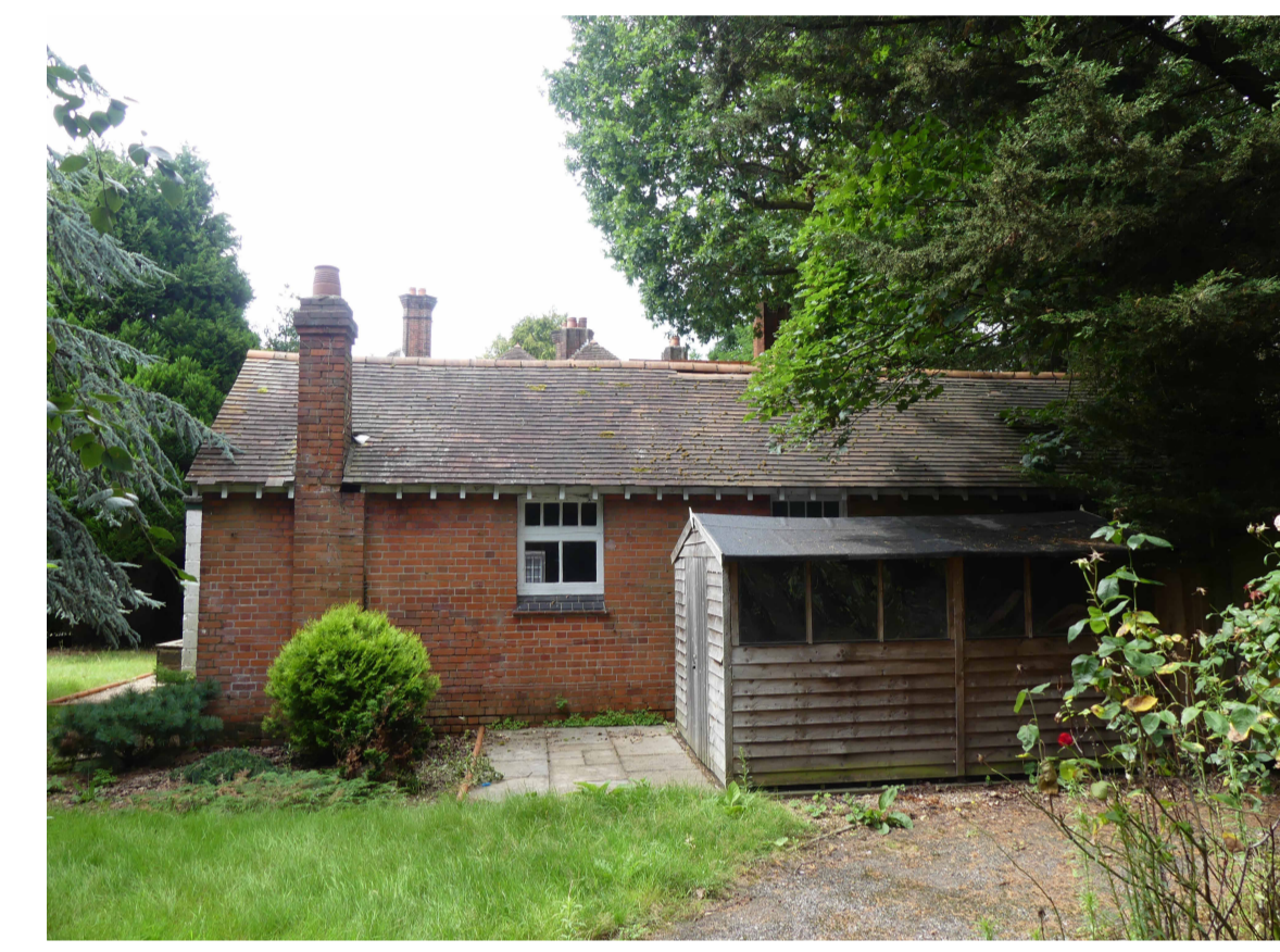
3 Building to be Demolished