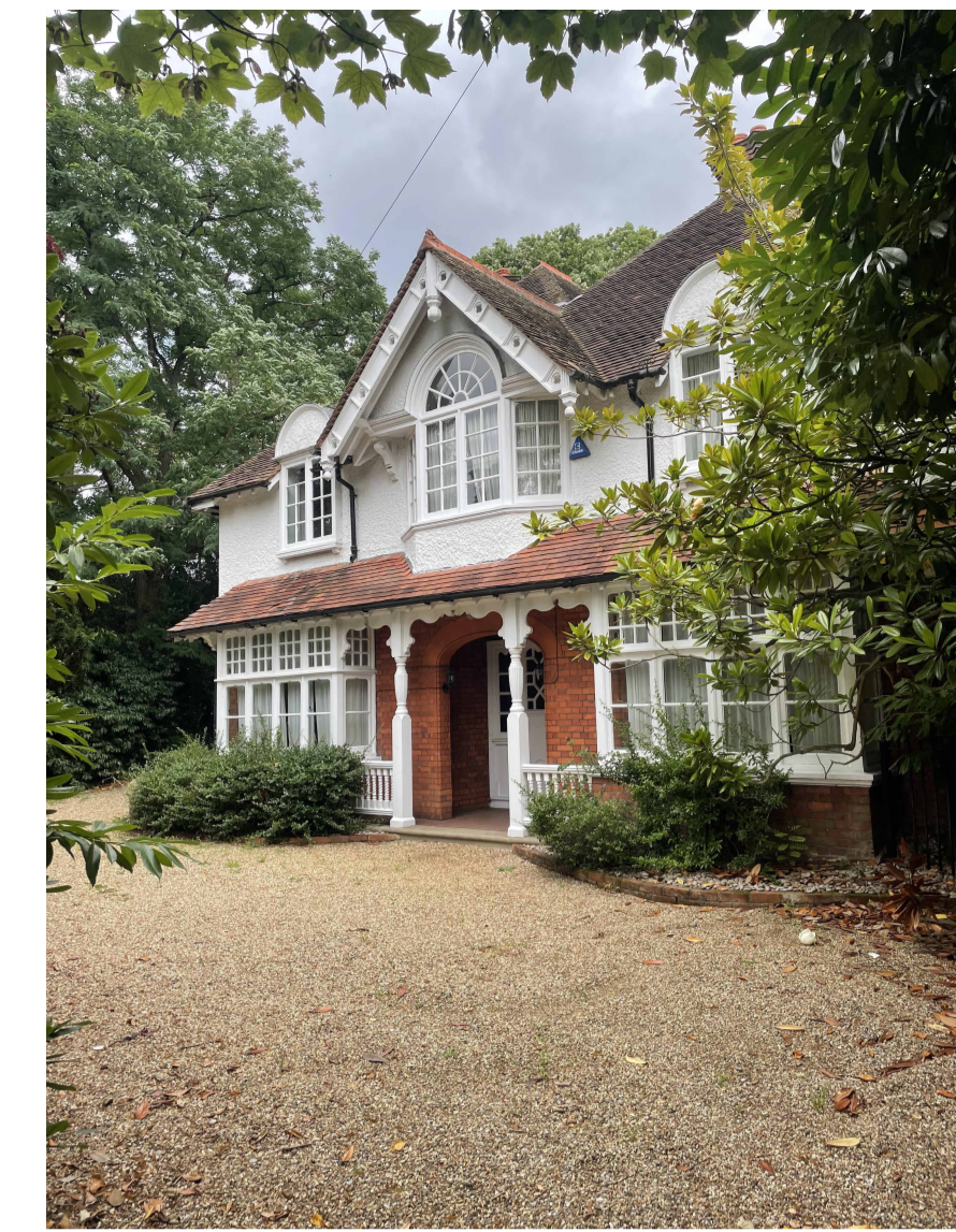
1 Building to be Demolished