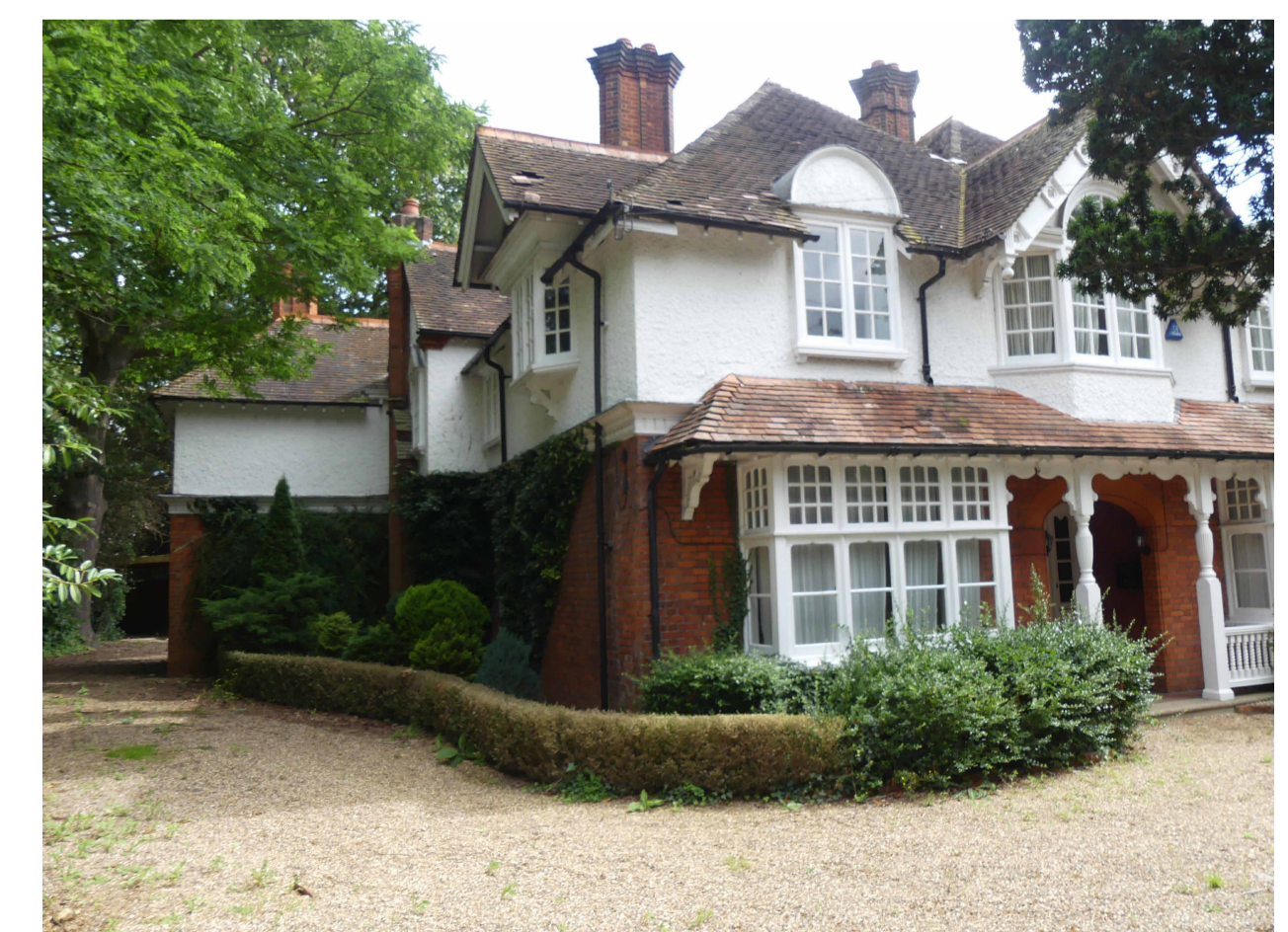
6 Building to be Demolished