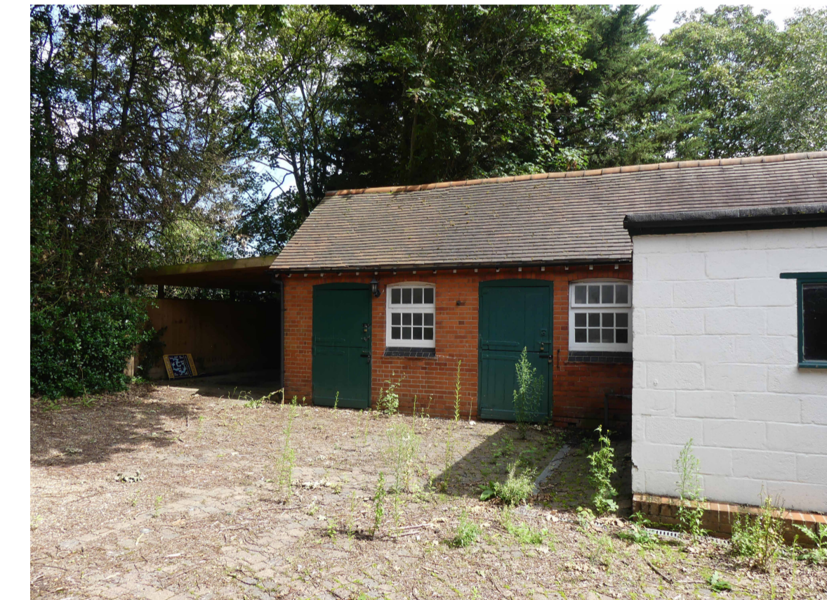
5 Building to be Demolished