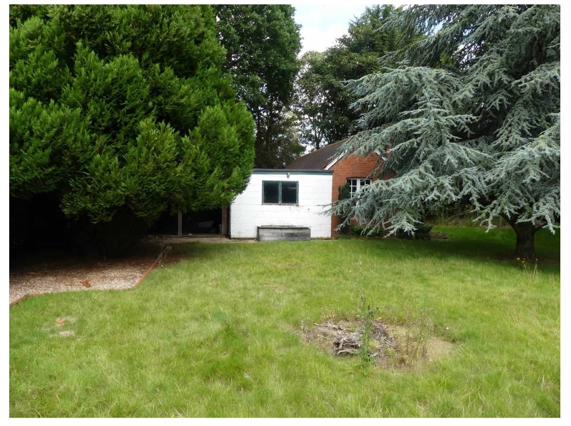
2 Building to be Demolished