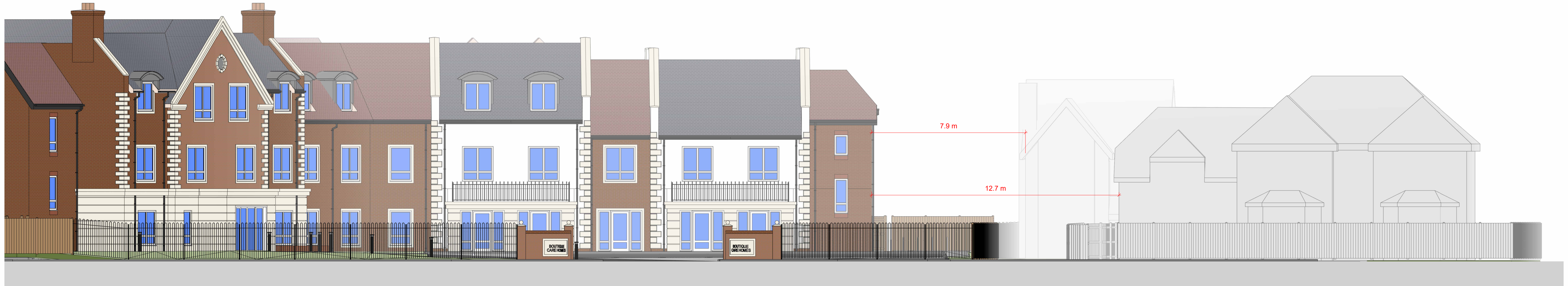
Street Section - Westmorland Road