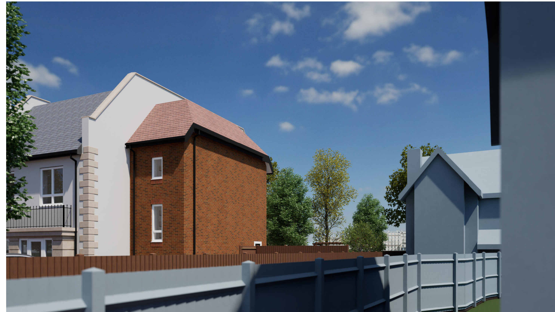
Southern Boundary Review - 3D View 2