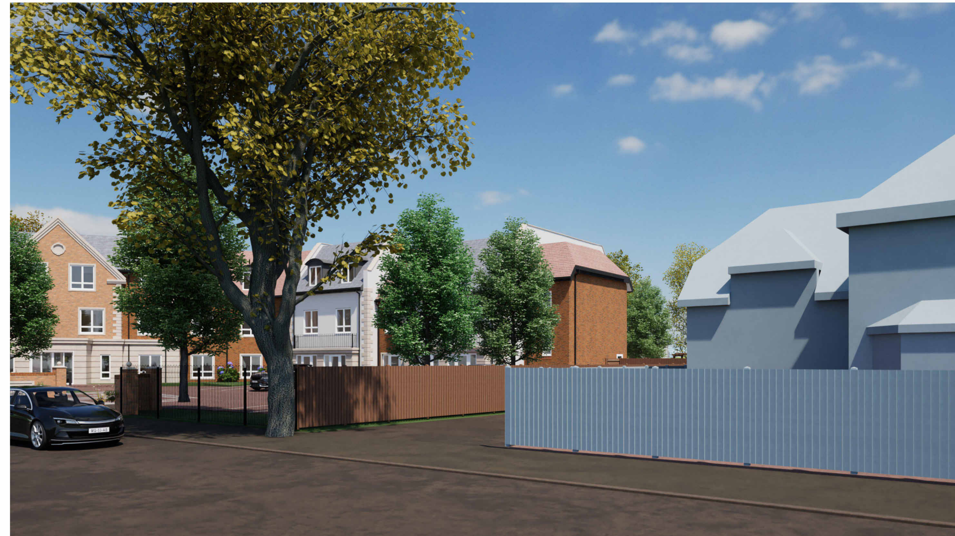
Southern Boundary Review - 3D View 1