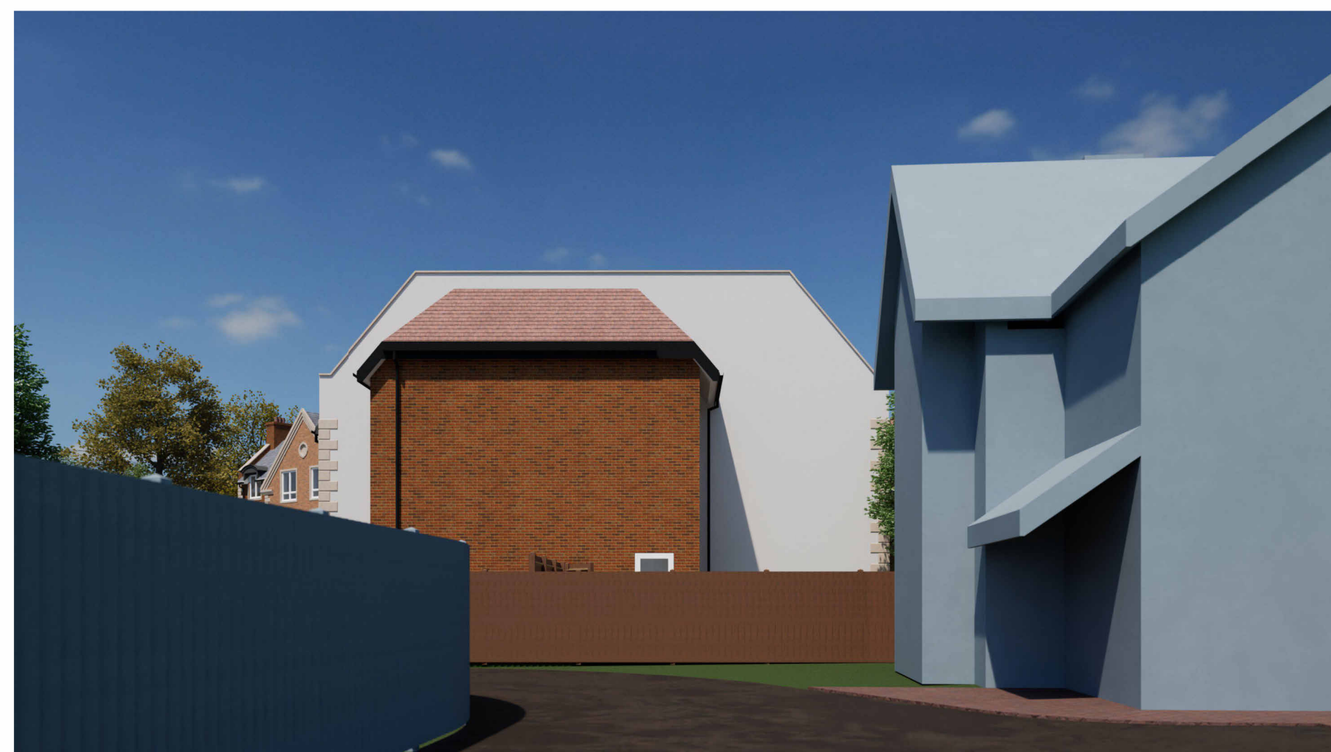
Southern Boundary Review - 3D View 3