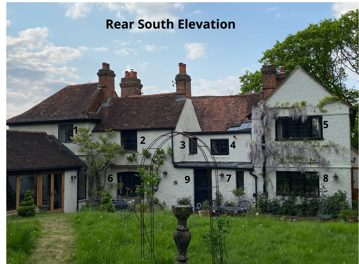
Rear South Elevation