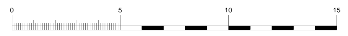
A2 DRAWING AT 1:100 SCALE