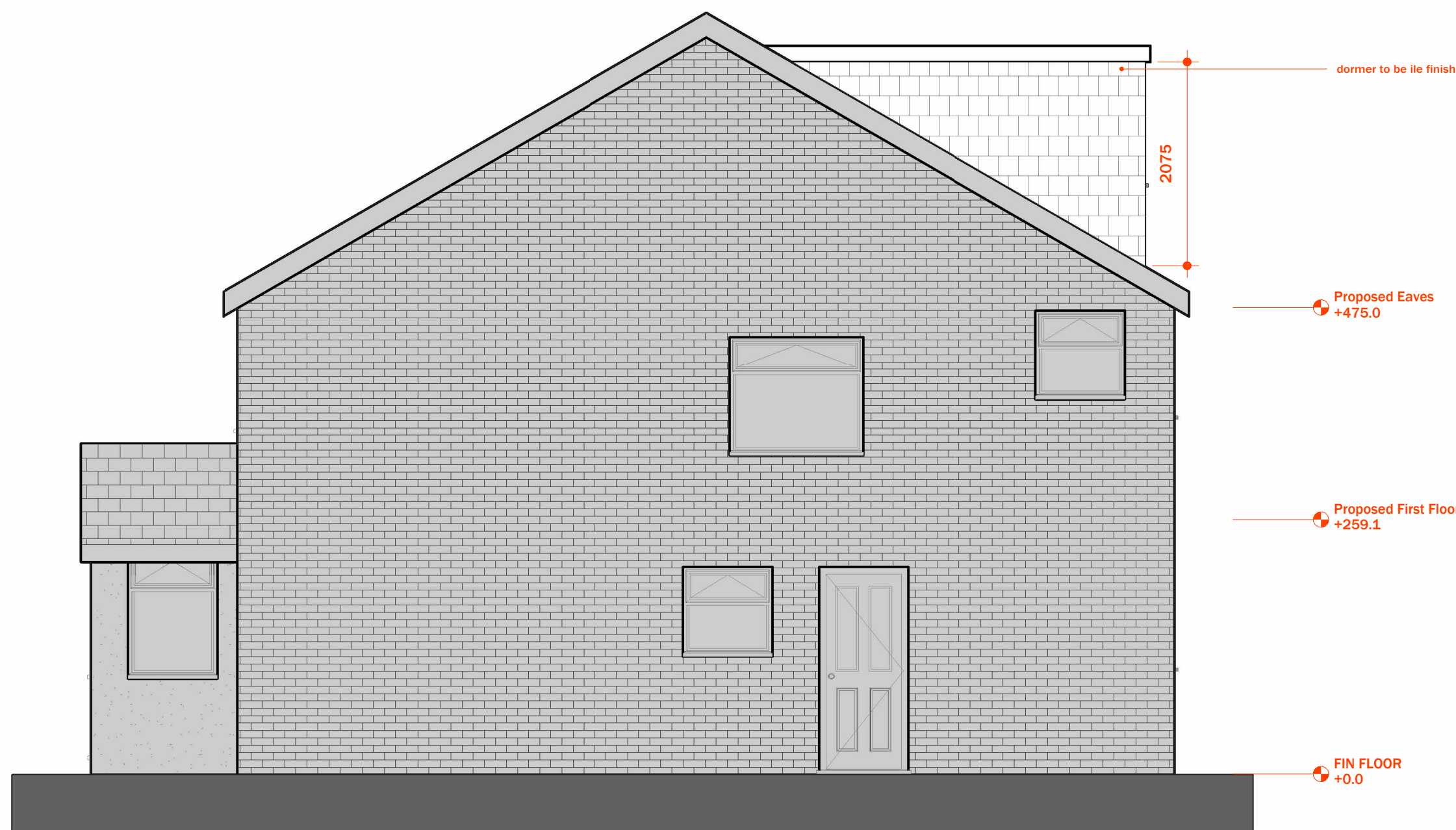
4 Proposed East SCALE: 1 : 50