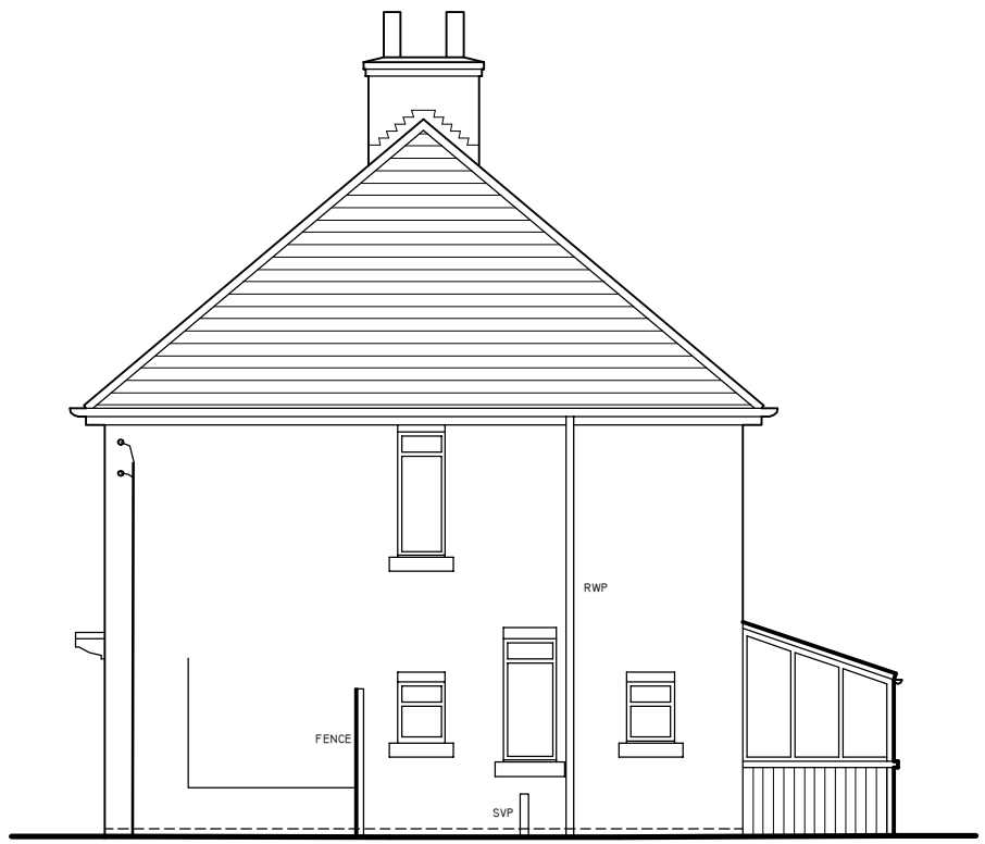
SOUTH EAST ELEVATION Scale 1:100 @ A3