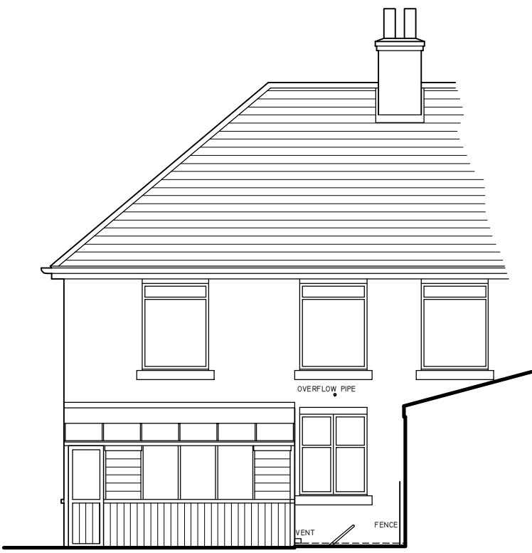
NORTH EAST ELEVATION Scale 1:100 @ A3