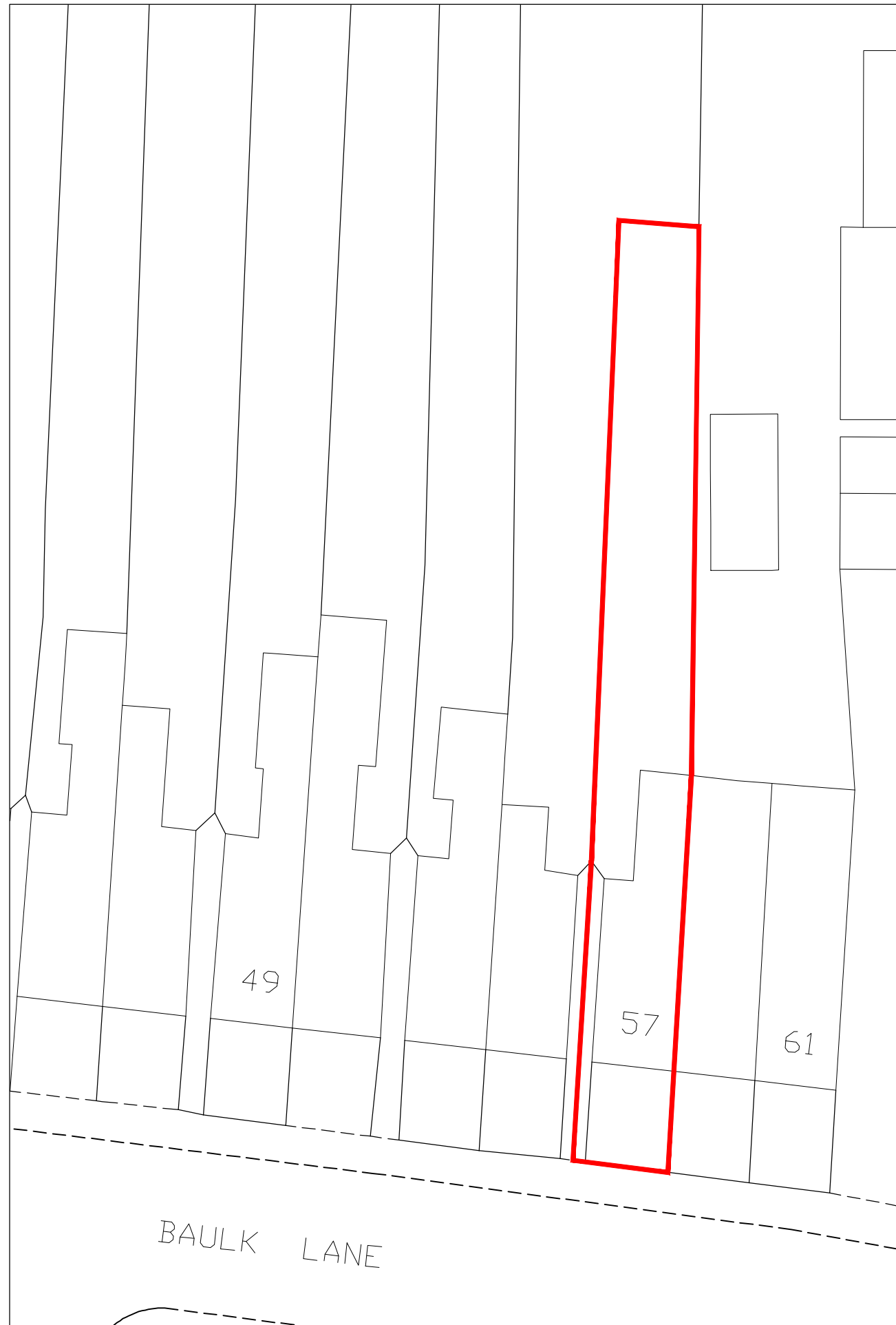
PROPOSED SITE PLAN 1:250