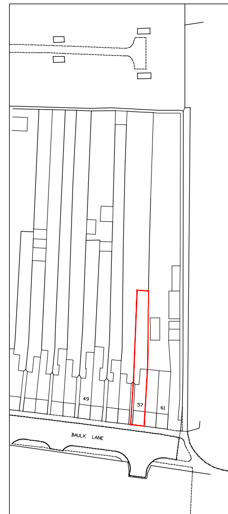
SITE LOCATION 1:1250

FOR THE OUTSTANDING RISKS PLEASE SEE "P.D'S DESIGNERS RISK ASSESSMENT REGISTER" WITHIN THE PRE-CONSTRUCTION H&S FILE.