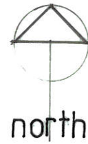
LOCATION PLAN SCALE : 1:1250