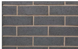
Blue/Grey Engineering bricks