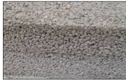
Sustainable porous Concrete Or similar