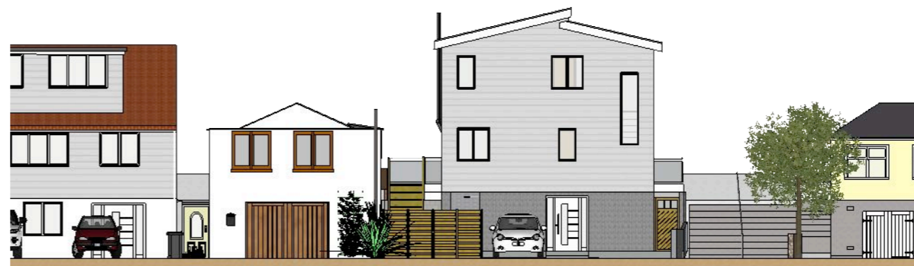
PROPOSED FRONT (CUL DE SAC) ELEVATION