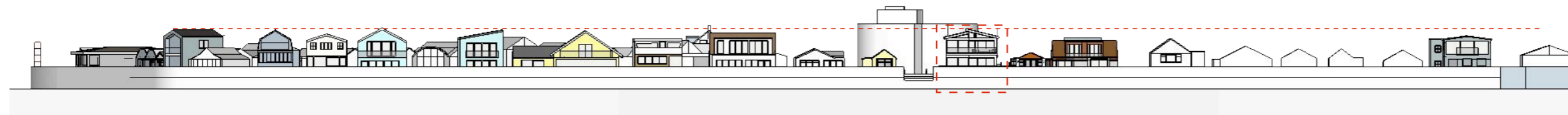
PROPOSED REAR STREET SCENE (FROM BEACH) scale 1:700