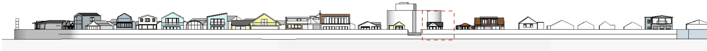
EXISTING REAR STREET SCENE (FROM BEACH) scale 1:700

<EK Architectural Design> <Homestead Lodge Heath Road East Bergholt Suffolk CO7 6RL>