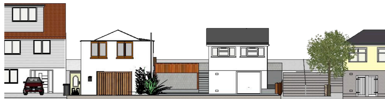
EXISTING FRONT (CUL DE SAC) ELEVATION