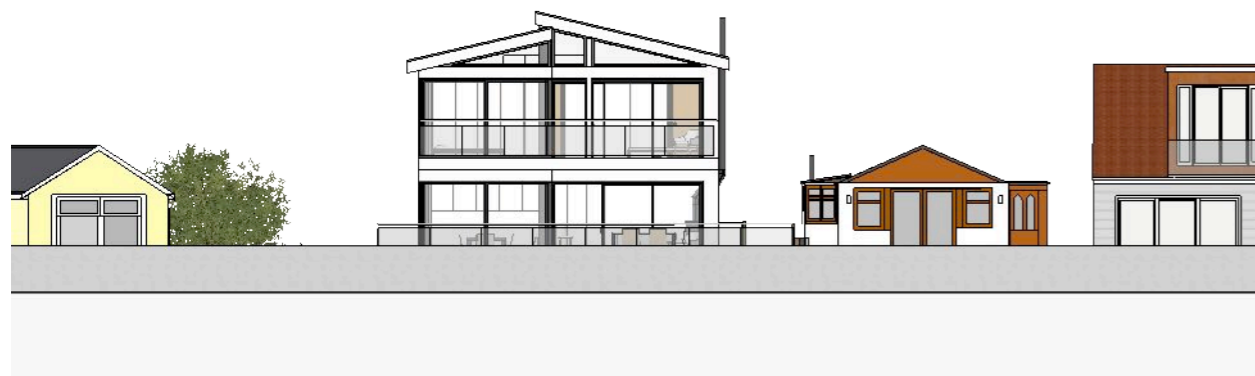
PROPOSED REAR (BEACH) ELEVATION