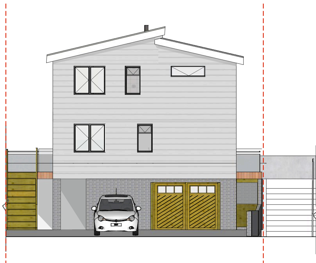
PROPOSED FRONT ROADSIDE ELEVATION

<EK Architectural Design> <Homestead Lodge Heath Road East Bergholt Suffolk CO7 6RL>