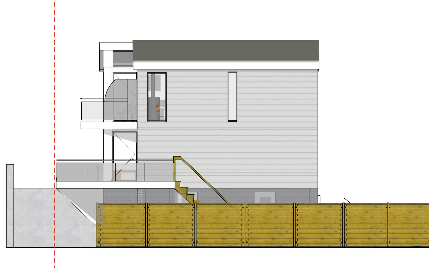
PROPOSED SE SIDE ELEVATION

Showing changes to Windows and External doors to suit internal floor plan amendments. Relocated stair vertical window from rear to SE side. Re-positioning of bathroom obscured widows Relocated front door from Front to Rear. Relocated Barn Doors from SE side to Front.