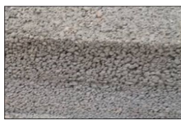
Sustainable porous Concrete Or similar