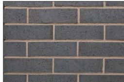
Blue/Grey Engineering bricks