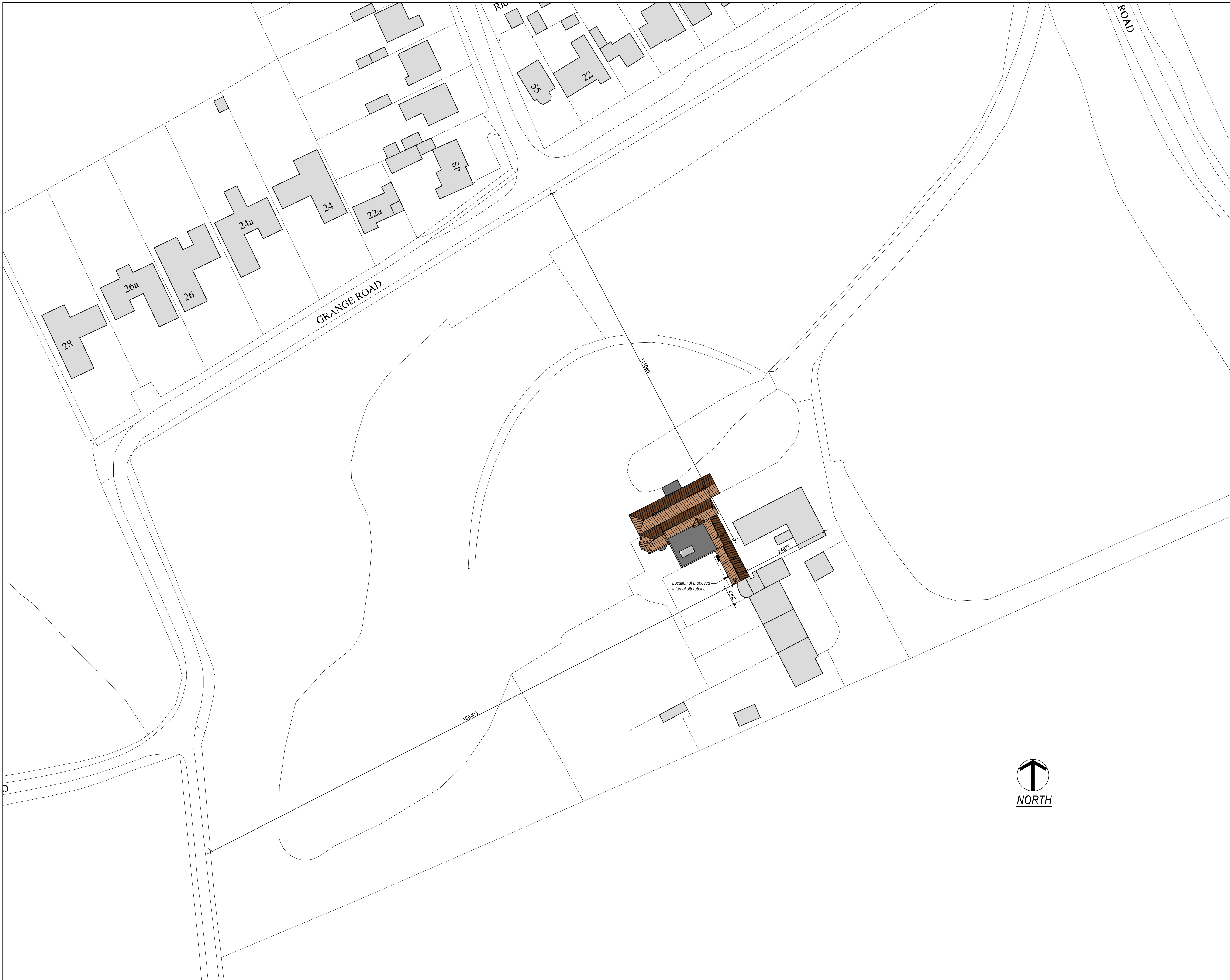
Proposed Site Plan - Scale: 1:500