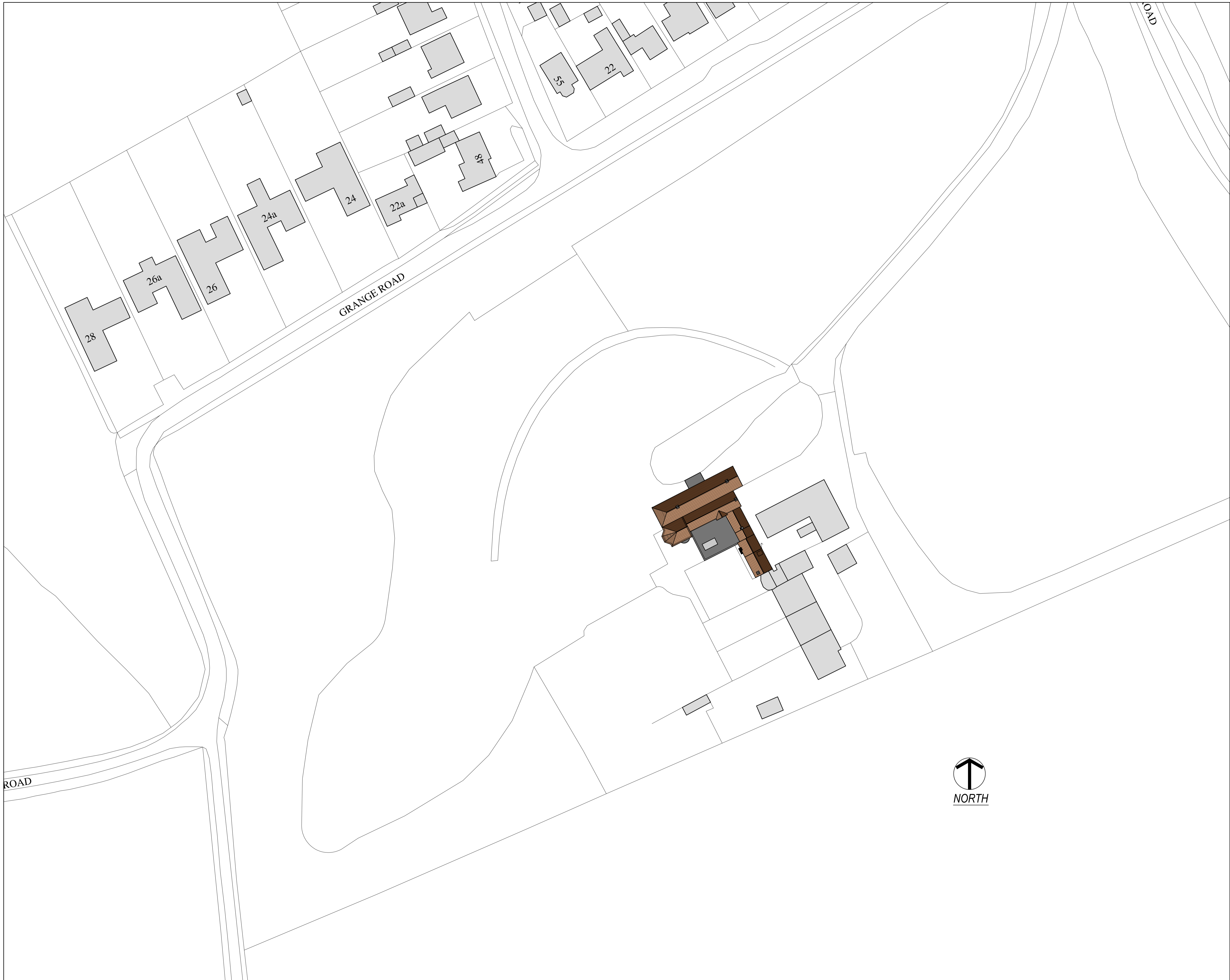
Existing Site Plan - Scale: 1:500