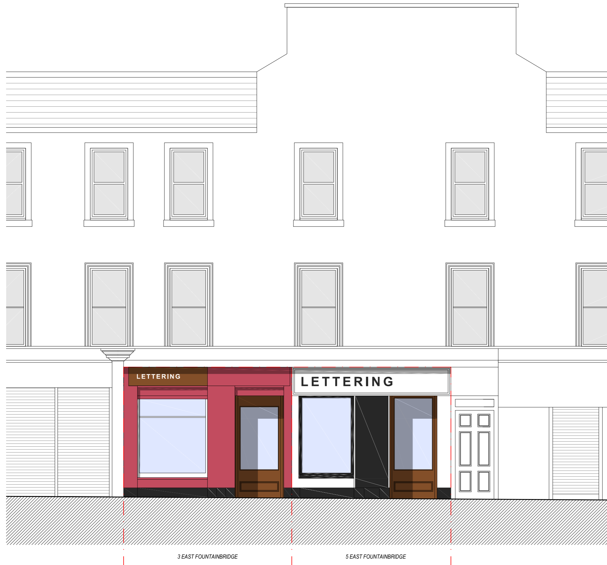
OUTLINE OF EXISTING TAKEAWY UNITS