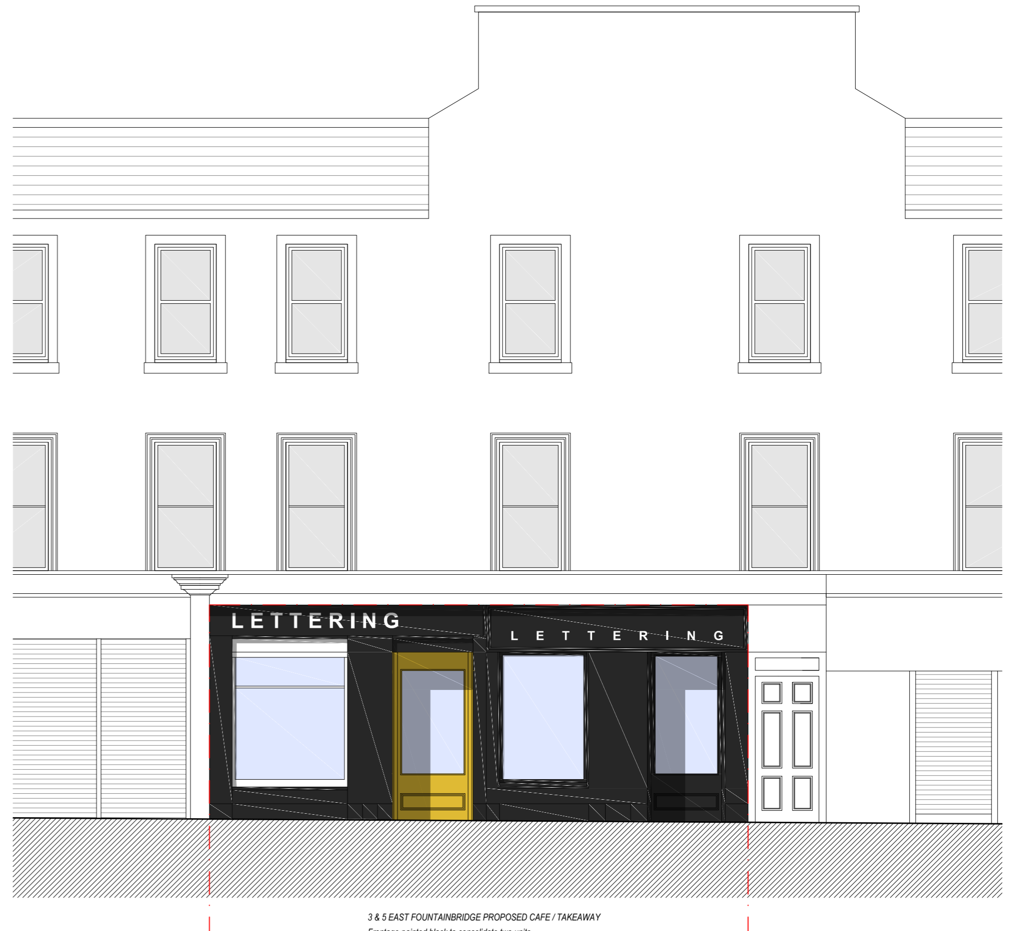
OUTLINE OF PROPOSED CAFE / TAKEAWAY